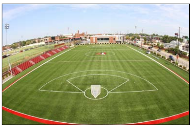
UofL Lacrosse Stadium (Built 2006)