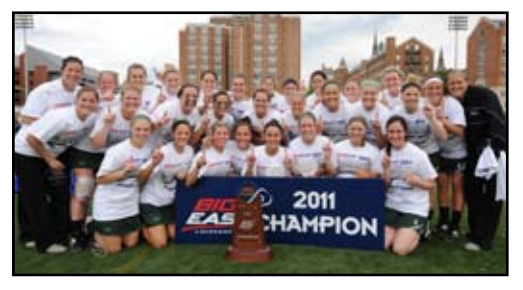
Loyola won its first tournament title in 2011