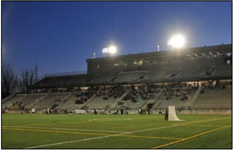
RIDLEY INTERCOLLEGIATE ATHLETIC COMPLEX (BUILT 2010)