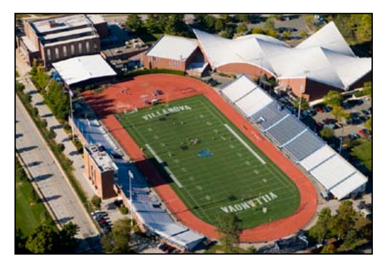
VILLANOVA STADIUM (BUILT 1927)