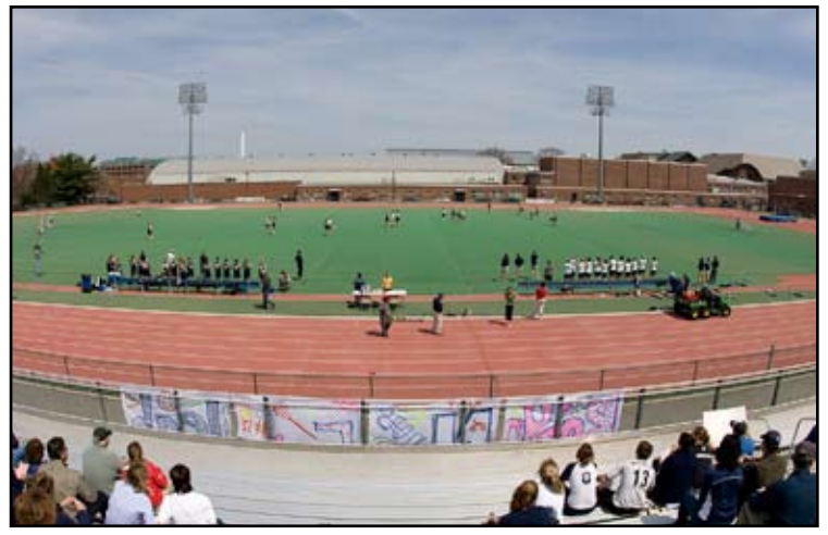
GEORGE J. SHERMAN-FAMILY SPORTS COMPLEX (BUILT 1995)