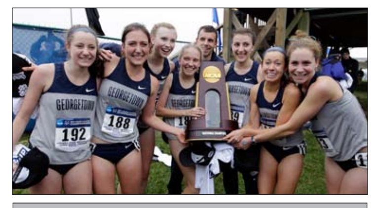
GEORGETOWN WON THE 2011 NCAA CROSS COUNTRY CHAMPIONSHIP