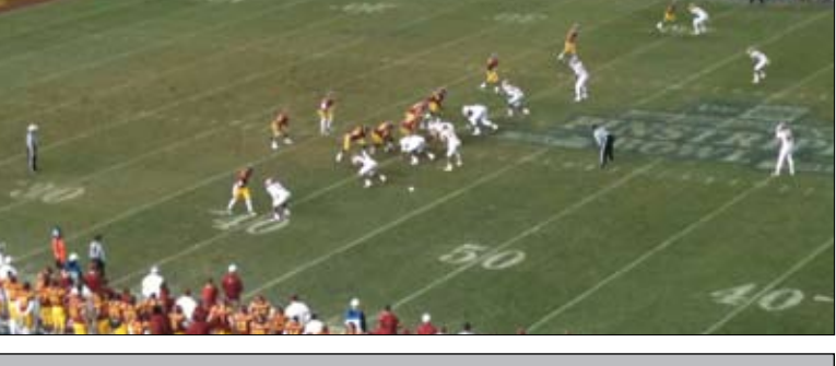
RUTGERS BEAT IOWA STATE BEFORE MORE THAN 38,000 FANS IN THE 2011 PINSTRIPE BOWL