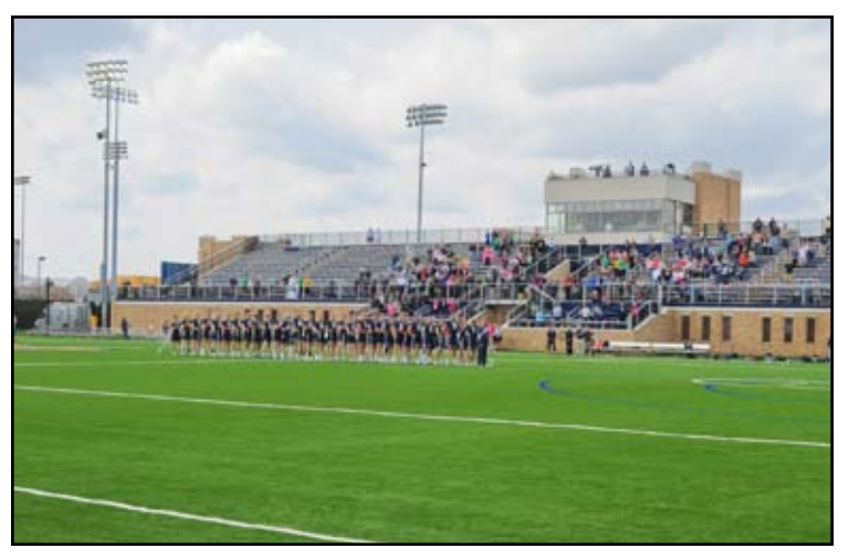
Arlotta Stadium (2009)