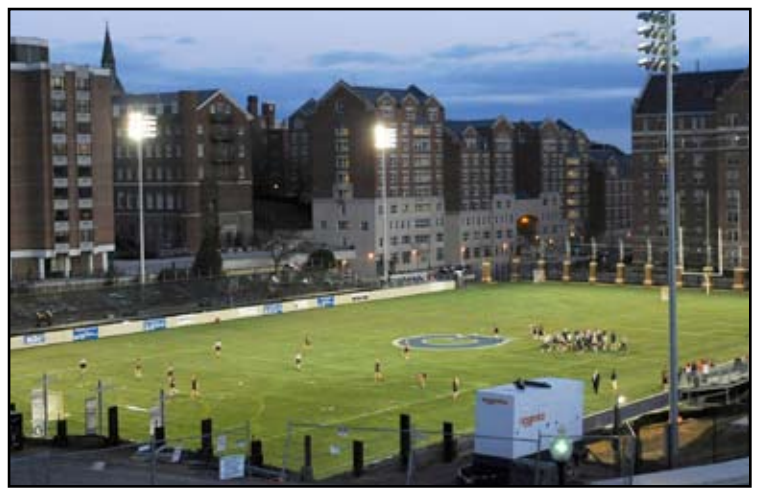
MULTI-SPORT FIELD (BUILT 2005)