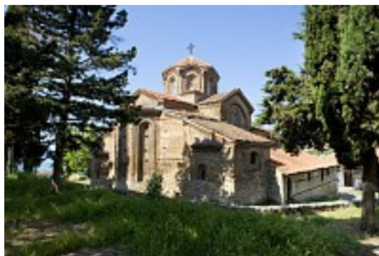
Holy Mother of God-Peribleptos, Ohrid