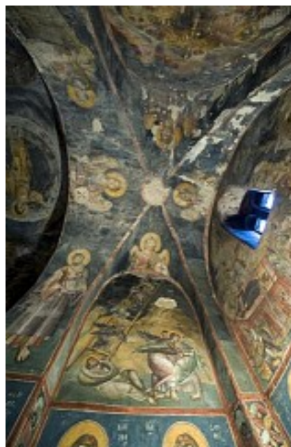
The Church of the Holy Mother of God – Peribleptos – fresco painting