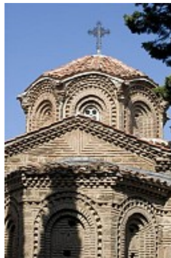
The Church of the Holy Mother of God – Peribleptos