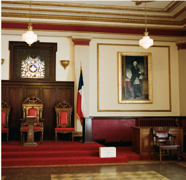
Parsons Lodge Room