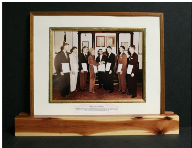
The wood stand is from a tree on the old home place where the boys grew up (see the photo of the picture on the stand in the library).