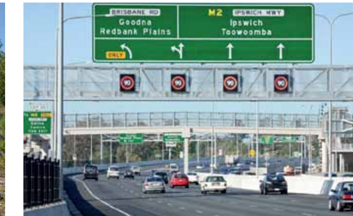
Example of completed motorway upgrade with variable speed limit signs