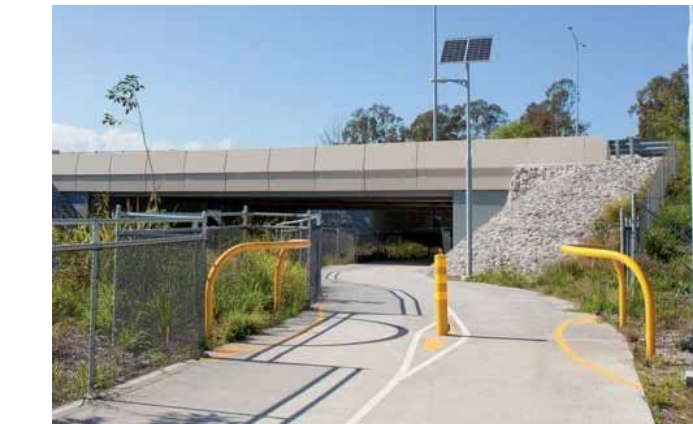
Example of dedicated cycleway