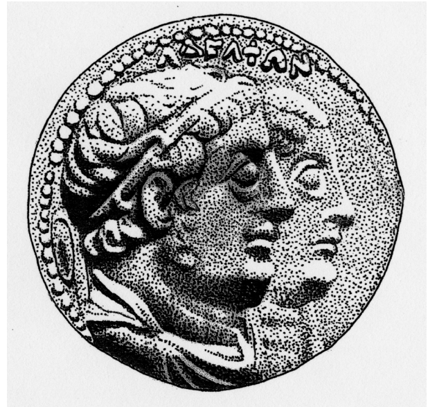
Fig. 2. Ptolemy II (reign: 282–246 B. C.) and wife Arsinoë. From RICHTER (1965): fig. 1781. London. See 3.1.1.

2002) in much the same way as the Ptolemies' library was for book collections (BARNES 2000). PTOLEMY II's animals were exhibited to the general public on special occasions such as the whole day procession of the second Ptolemaieia which took place at a date still open to discussion, some time between 280/79 and 271/70 (RICE 1983: 5; FOERTMEYER 1988; COARELLI 1990: 233, 246; KÖHLER 1996: 36), and also displayed to foreign visitors as an outward sign of power and prestige (DIODORUS OF SICILY 3.37.7).