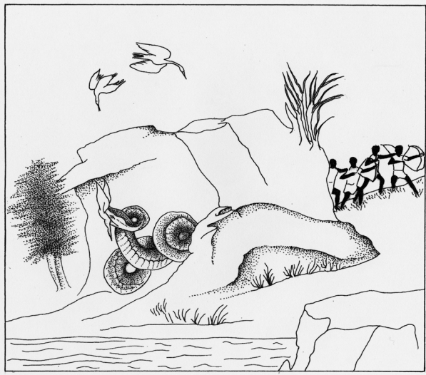
Fig. 1. Nile mosaic of Palestrina, end of second century B. C. (upper level, section 1). From MEYBOOM (1995): fig. 9. See 2.2.