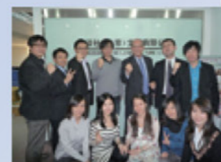
Staff of Kodansha Beijing Culture Ltd.

Our offices in New York, London, Beijing and Taipei, publish comics and magazines targeted at markets in each country.