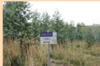
Eucalyptus grove near Melbourne

The Museum collection is comprised of paintings by early modern Japanese masters Taikan Yokoyama, Gyokudo Kawai, Takeji Fujishima and Saburosuke Okada; important manuscripts and papers from Kodansha history; and illustrations in ink and watercolors by Yutaka Murakami. The museum gardens are renowned for their tranquil beauty.