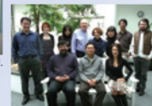
Staff of Kodansha USA, Inc.