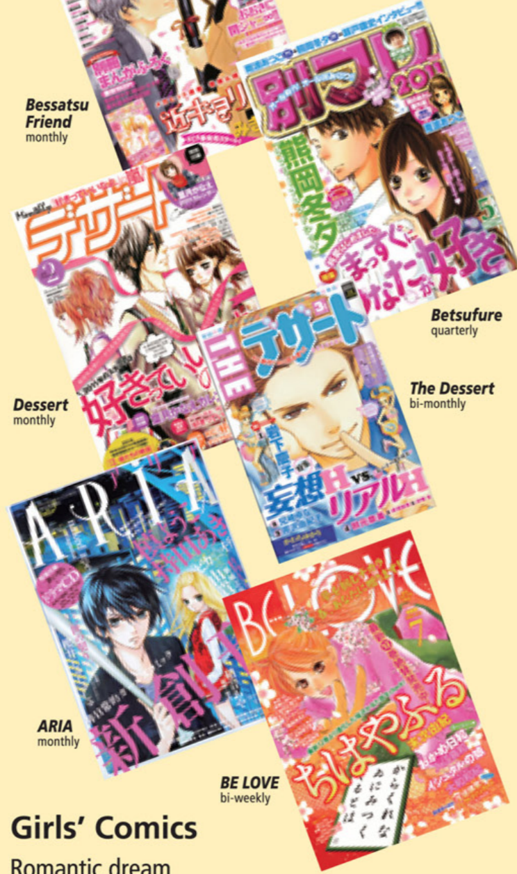
Bessatsu Friend monthly

Since 1967, Kodansha Comics have captivated leagues of die-hard fans with such immortal sports tales as Kyojin no Hoshi and Ashita no Joe , and romantic adventures like Sailor Moon .