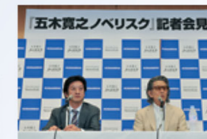
Itsumi Hiroyuki (right), a leading writer of fiction and essays, was the first Japanese author to publish his complete works in e-book format.

Kodansha was quick to see the potential of e-books. We are now a market leader and our titles are available for a range of e-readers. We aim to digitize around 20,000 titles in 2012 to offer a more convenient, high-quality reading experience.