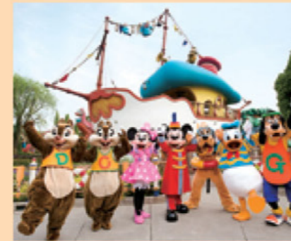
Tokyo Disneyland / TOONTOWN

In 1998, Kodansha co-invested in a project in eastern Australia to convert overgrazed pasture land into renewable eucalyptus groves to be harvested for paper pulp. By the mid-2000s the project had proved so successful that we purchased 500 more hectares near Melbourne and another 765 hectares in New Zealand exclusively for our own needs. Since 2009 the New Zealand project has been shipping eucalyptus chips to Japan as part of a regular cycle of harvesting and replanting managed by local forestry cooperatives, while harvesting of the Australian groves is slated to begin in 2016.