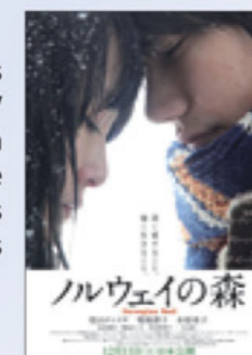
©2010 Norwegian Wood, Haruki Murakami, Asmik Ace, Fuji Television

Selling the rights to adapt Kodansha novels and manga into live-action films, TV dramas, anime and merchandise is a fast-growing business. Maximizing the number of revenue streams from hit titles and creating new forms of merchandising is now a pillar of Kodansha's business model.