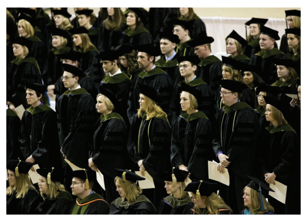
2008 College of Pharmacy and Health Sciences Hooding Ceremony.