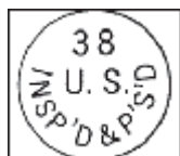
Inspection mark on raw meat

Meat that has been federally inspected and passed for wholesomeness is stamped with a round purple mark. The dye used to stamp the grade and inspection marks onto a meat carcass is made from a food-grade vegetable dye and is not harmful. (The exact formula is proprietary/owned by the maker of the dye.) The mark is put on carcasses and major cuts. After trimming, the mark might not appear on retail cuts such as roasts and steaks. However, meat that is packaged in an inspected facility will have an inspection mark which identifies the plant on the label.