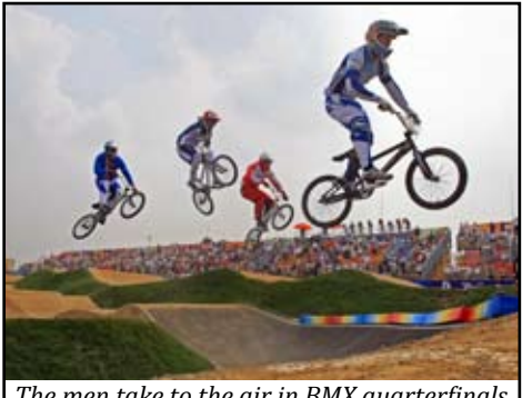
The men take to the air in BMX quarterfinals.

While in Beijing, Johnson will attend a series