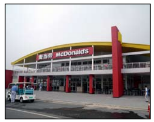
McDonald's on Olympic Green is site for ATR Newsmaker Breakfasts.

you have the British public. And what is quite remarkable is the very high level of support the Olympics enjoy. The public are in a different place than a lot of our media a lot of the time.