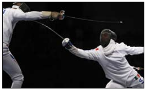
Italy's Matteo Tagliariol lunges on the way to a gold medal in individual epee.

Roch said the technological advances prove that the sport, which has been part of the Olympics since 1896, is changing with the times. Although the IOC constantly reevaluates the Olympic program, Roch says, "We don't see keeping in the Olympic Games any problem at all. Our