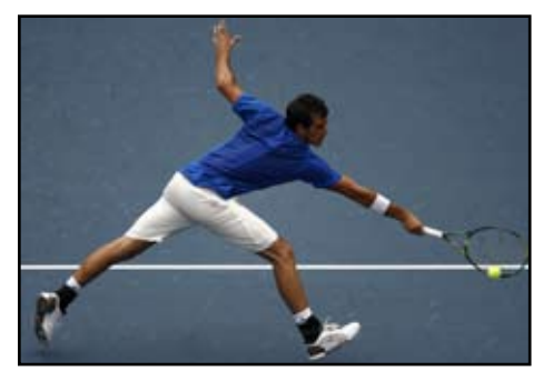
Both men's and women's tennis schedules will be adjusted after heavy rain.

A second day of rain in Beijing could cause more complications for BOCOG after delays were posted Monday for archery, rowing and tennis due to downpours.