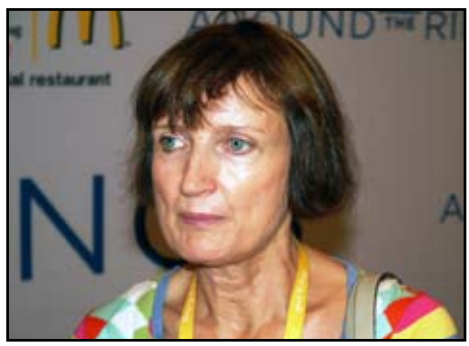
London 2012 Tessa Jowell