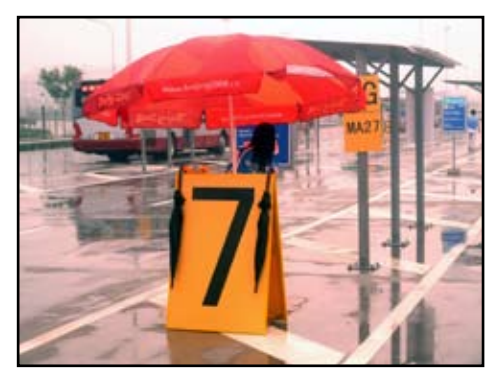
A volunteer sticks under her umbrella.

A steady rain on Day Two of the Olympics meant delays for tennis, but a BOCOG leader said the change in weather means that skies may clear in the coming days.