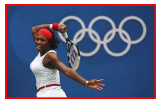
The match between Serena Williams (U.S.) and Olga Govortsova (Belarus) was delayed due to rain.