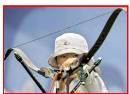
South Korean archer Park Sung-Hyun takes aim in the women's team competition.