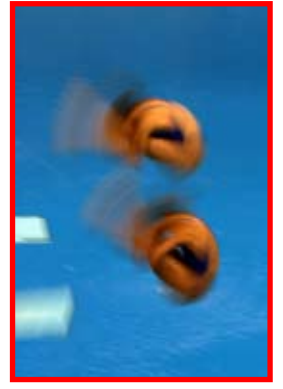
Italy's women earned sixth place in the synchronized diving 3m springboard.