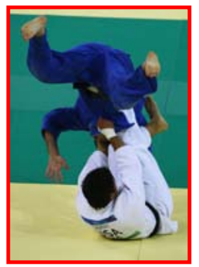
The 60-66kg judo competition on Day 2 of the Games.