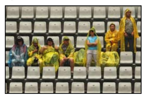
All the tickets are sold to the Beijing Olympics, but empty seats abound on the first days of competition.

Whether rain is the reason, the stands were largely empty for events at outdoor venues Sunday. But Saturday, a dry (though not clear) day, was much the same.