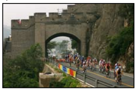
The men's road cycling event toured the Great Wall today.

Samuel Sanchez of Spain is the gold medalist for the cycling road race, an event that passed by some of China's most famous landmarks.