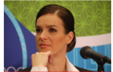
Skating legend Katarina Witt is part of the Munich 2018 team.