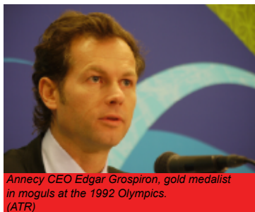
Annecy CEO Edgar Grosperon, gold medalist in moguls at the 1992 Olympics.

The Annecy bid for 2018 made its first presentation with a team drawn from the local and national levels.