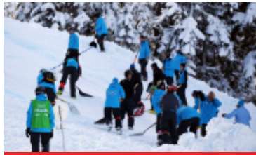
Volunteers jokingly refer to themselves as "smurfs" due to their bright blue jackets.

The climate is good for the people buzz of the Games. Bustling crowds in downtown Vancouver and in Whistler give these Games a festive feel. The popularity of the legacy