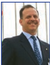
Jordan NOC leader Prince Faisal bin Al-Hussein