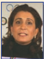
NAWAL EL MOUTAWAKEL

Hickey, 62, has been an IOC member since 1995 and president of the Olympic Council of Ireland since 1989.