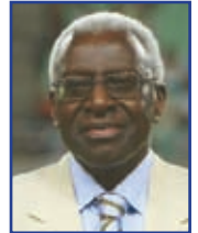
IAAF President and IOC member Lamine Diack