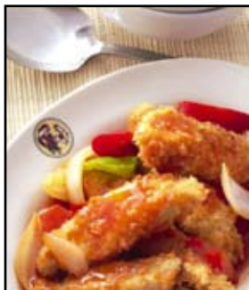
Sweet and Sour Fish