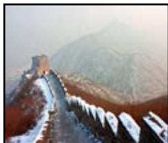
Great Wall of China

1934-1936: Long March, massive military retreat by CCP to escape KMT