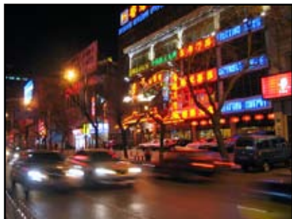
Nightlife of Beijing