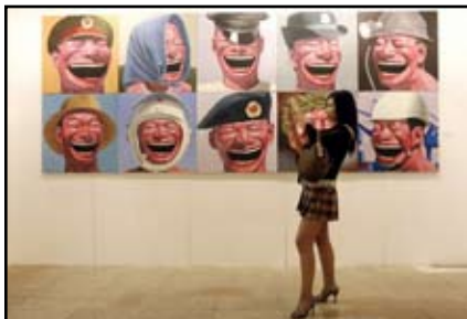
A woman snaps a photo of art on display in front of an oil on canvas painting entitled "Hats" by artist Yue Minjun