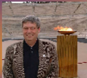
Photo: Ted Heath with Olympic flame in 1992

On the scene reports on Evaluation Commission visits ... the Around the Rings Olympic Bid Power Index – the most authoritative ranking of the cities outside the IOC ... and much more – delivered to your inbox!