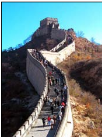
Badaling Great Wall

Known to the Chinese as the "10,000 Li Wall," the Great Wall (Wan Li Changcheng) stretches from its scattered remains in Liaoning province to Juayuguan in the Gobi Desert. The wall was first constructed during the Qin dynasty (221-207 BC) for the sole purpose of protecting the Chinese kingdom from the nomads. Separate walls were built by different dynasties thereafter and were finally linked together after ten years of hard labor under the command of General Meng Tian. Despite popular belief, the Great Wall cannot be seen from space with the naked eye.