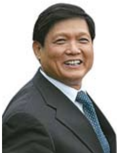
BOCOG President Liu Qi