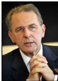
IOC President Jacques Rogge