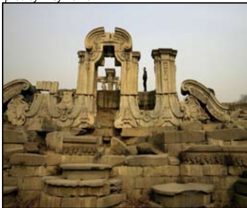
Ruins of Yuanming Yuan in Beijing