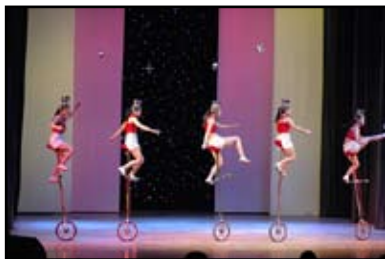
Wan Sheng Theater

Wan Sheng Theater: Showcasing one of Beijing's best acrobatic shows, this theater is located west of Temple of Heaven. 95 Tianqiao Shichang Jie, West of Temple of Heaven, Tianqiao Tel: (+86) 10 6303 7449