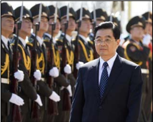
Hu Jintao has been president of PRC since 2003