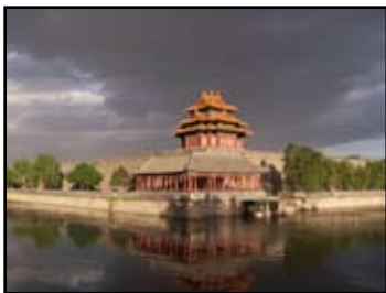
The Forbidden City

The Forbidden City was built during the Ming (1368-1644) and Qing (1644-1911) dynasties and is one of the must-sees in Beijing. The complex has a total of 8,706 rooms and covers 182.78 acres of land.