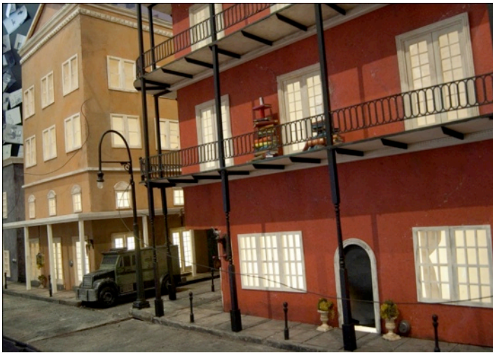
Here is the handmade set of the French Quarter one of the first scenes featuring Mr. Moriss Lessmore at Artspace