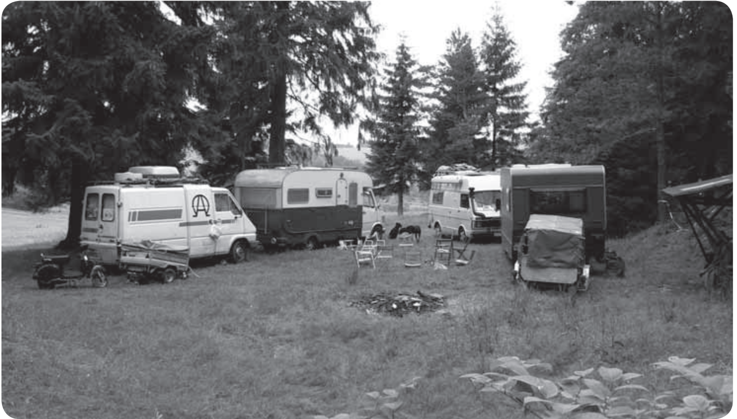
Camps with Caravans

for nappies he started feeling a bit queasy and began to think.