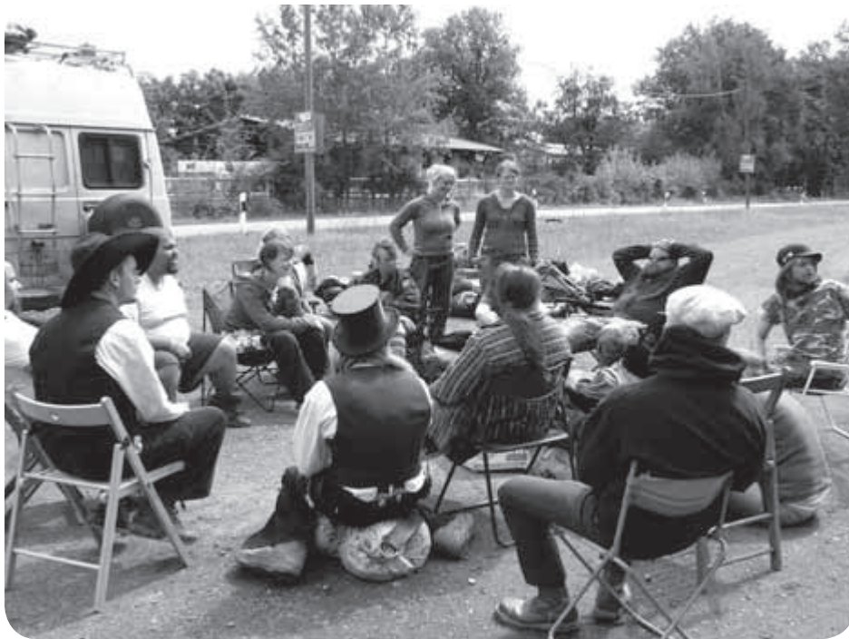
Briefing at the Convoy

After a mother pointed out to a father for the third time that she again didn't have money