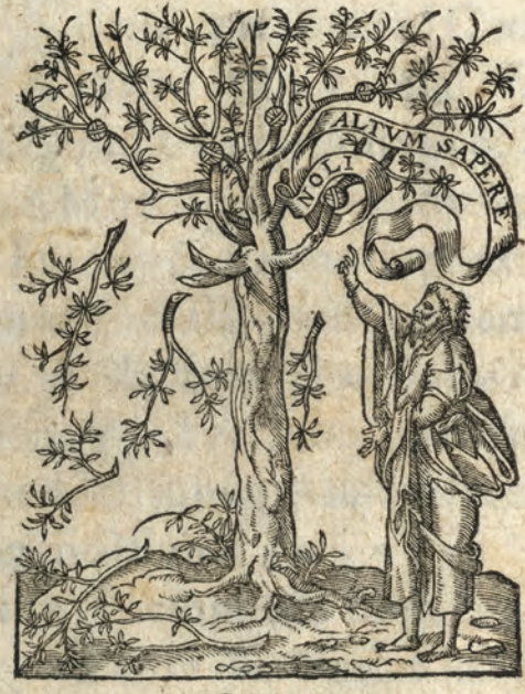
GENEVA. EXCVDEBAT PAVLVS STEPHANVS. ANNO M. DCI.

Adiuncta est interpretatio versuum Latina, ad verbum, per Gylielmym CANTERYM. Additæ funt & eiufdem G. CANTERI Annotationes, necnon Epitome CASSAN-DRÆ Græcolatina, carmine Anacreontio.