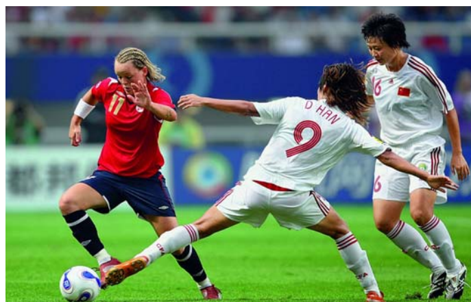
Long-standing hot property: the Norwegian women's national team

When, in 1995, today's FIFA President said "The future of football is feminine", it was more than mere lip service. It reflected a strong belief in the huge potential that women's football has to develop. Ever since, FIFA has given targeted support for the efforts of associations who offer women the same opportunities to develop as male players. Launched in 1998, FIFA's Financial Assistance Programme (FAP) introduced a requirement in 2004 for the associations and confederations to invest at least 4% of their FAP funding into women's football. This threshold was increased to 10% in 2005. On top of this commitment, FIFA also promotes the women's game in more general ways by directly financing women's matches and organising competitions and symposiums. Thanks to its development programmes, FIFA is also playing an active role in the training of administrators, coaches, referees and sports doctors.