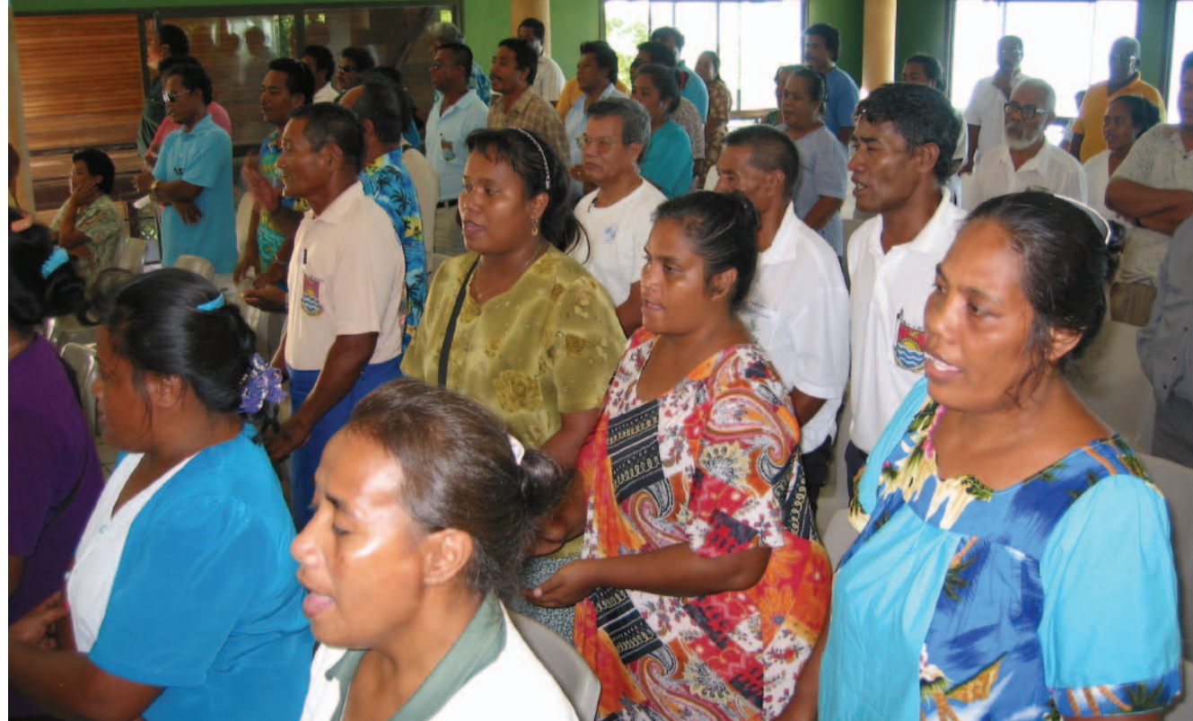
National consultations in Gilbert and Line Islands

Health. The GEF-supported project—Piloting Climate Change Adaptation to Protect Human Health—aims to implement a range of strategies, policies, and measures that will decrease health vulnerability to current climate variability and future climate change in seven countries having different kinds of vulnerable ecosystems: Barbados and Fiji (low-lying developing); Uzbekistan and Jordan (desert/desert-fringe); and Bhutan, Kenya, and China (highland populations). Implemented in collaboration with the World Health Organization and UNDP, the project will begin by assessing health vulnerabilities for each country, analyzing successes and failures of past health interventions under current climate,