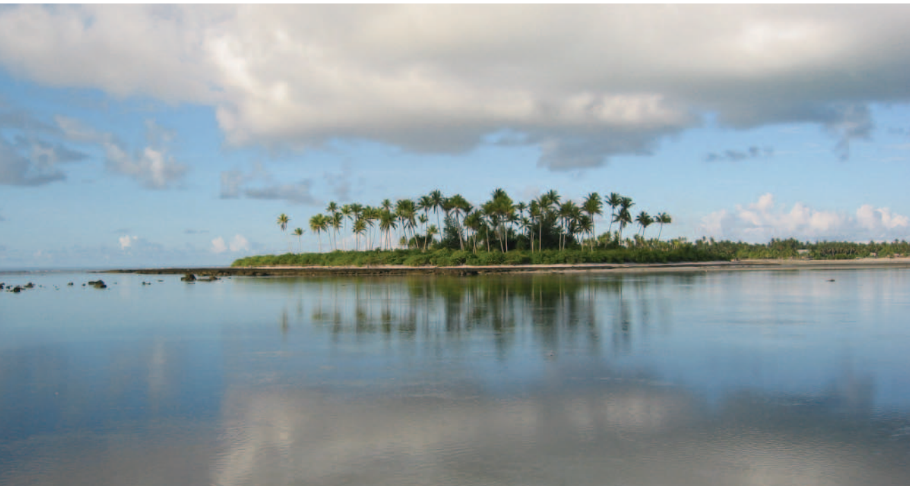
Low-lying Pacific islands are vulnerable to sea level rises

The Least Developed Countries (LDCs) are among the most vulnerable and least able to adapt to the ravages of climate change. The Least Developed Countries Fund was established under the Climate Change Convention to help these countries achieve climate-