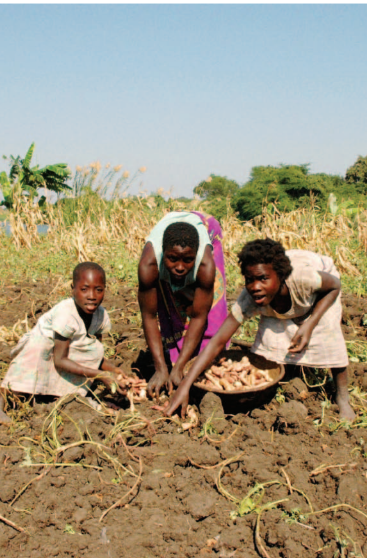
A family harvesting sweet potatoes, which are part of a crop diversification program in Zambezi Valley, Mozambique