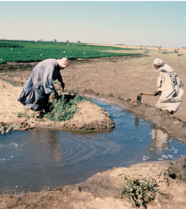
Farmers in drought-prone Sudan preparing irrigation channel

(GEF) is committed to helping countries deal with the multifaceted challenges posed by climate change. In fulfilling its mandate, GEF pursues a two-pronged approach: it helps developing countries launch projects that mitigate the effects of climate change by reducing emissions of greenhouse gases; and it helps countries adapt to climate change by undertaking activities that minimize its adverse effects.