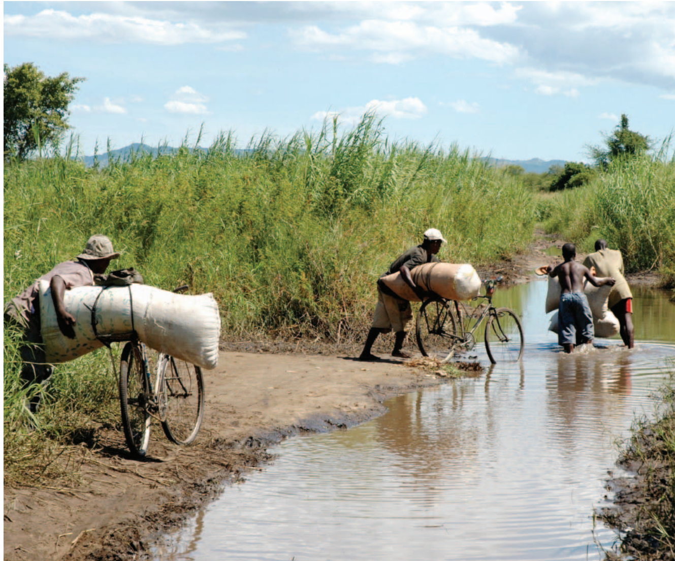
Because of the frequency of extreme events in Zambezi Valley, Mozambique, farmers often have to deal with cycles of floods and droughts

The Adaptation Fund. The management of the Adaptation Fund is under discussion within the context of the Climate Convention and the Kyoto Protocol. The GEF submission to the Convention Secretariat documented its availability, capacity, and necessary flexibility to manage the Adaptation Fund.