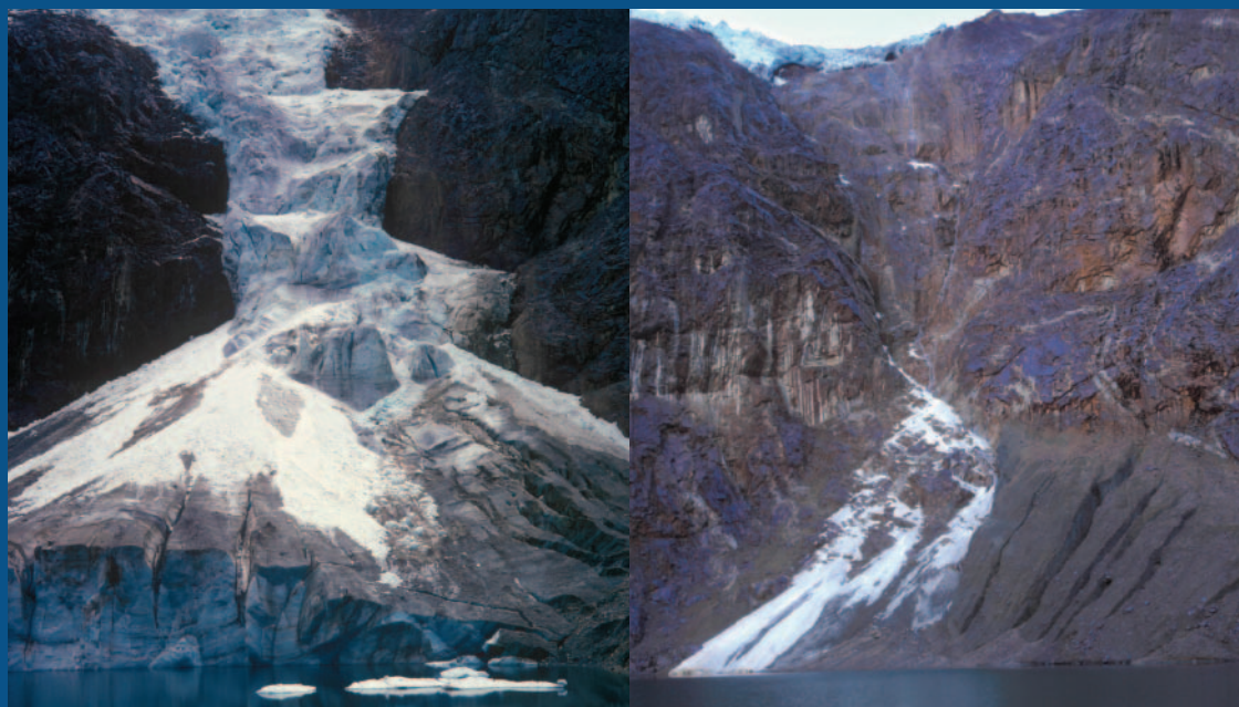
Glacier in the Peruvian Andes in 1980 and from the same position in 2002. Cordillera Blanca, Peru

analytical capacity for policy and project evaluation that can be expanded subsequently to include other sectors. Likely areas for immediate intervention are watersheds, and consequent impacts on hazards to life and property, watershed ecology and desertification, water availability for hydropower, human consumption, and productive use—for example, irrigation, agricultural productivity, fishery, and food security.