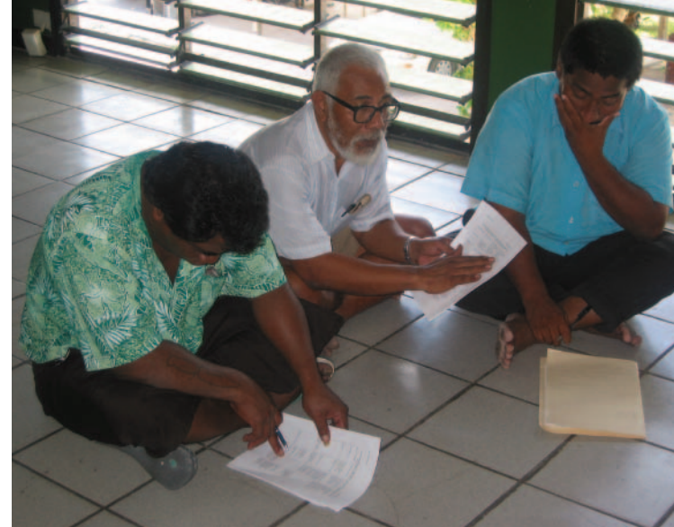
Stakeholders discussing a GEF adaptation project

Framed by these unique features, the GEF adaptation program follows several basic steps: first, gathering information through a sound scientific methodology and recognizing good practices and indigenous knowledge; second, evaluating existing policies and identifying those that increase countries' vulnerability (maladaptation); third, implementing projects that build adaptive capacity and integrate adaptation measures into development.