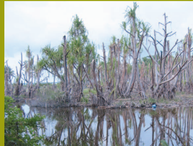
Kiribati: A dying pandanus forest resulting from saltwater intrusion

Expected project outcomes include stronger government capacity to deal with the consequences of the increasing climate risks, by fully integrating adaptation into economic planning and by enhancing legislation and regulations; and conservation and sustainable use of aquatic biodiversity through greater involvement of civil society and communities in the planning and management of the aquatic resources.