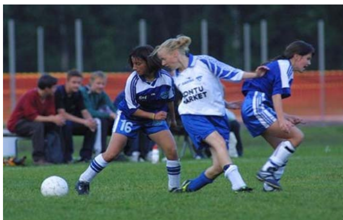
Hard-fought scene of women playing for their club ...

When, in 1995, today's FIFA President said "The future of football is feminine", it was more than mere lip service. It reflected a strong belief in the huge potential that women's football has to develop. Ever since, FIFA has given targeted support for the efforts of associations who offer women the same opportunities to develop as male players. Launched in 1998, FIFA's Financial Assistance Programme (FAP) introduced a requirement in 2004 for the associations and confederations to invest at least 4% of their FAP funding into women's football. This threshold was increased to 10% in 2005. On top of this commitment, FIFA also promotes the women's game in more general ways by directly financing women's matches and organising competitions and symposiums. Thanks to its development programmes, FIFA is also playing an active role in the training of administrators, coaches, referees and sports doctors.