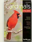
Enjoying Cardinals More