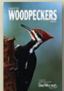
Enjoying Woodpeckers More

The Backyard Landlord's Pack will help customers be a better host to the birds and bats that are commonly found in our yards. From clinging birds to night-flying mammals, these booklets will help them enjoy the wonders of housing backyard wildlife. #DMBLL