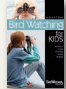
Bird Watching for Kids