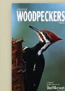
Enjoying Woodpeckers More