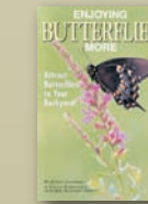
Enjoying Butterflies More