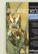
The Backyard Bird Watcher's Answer Guide