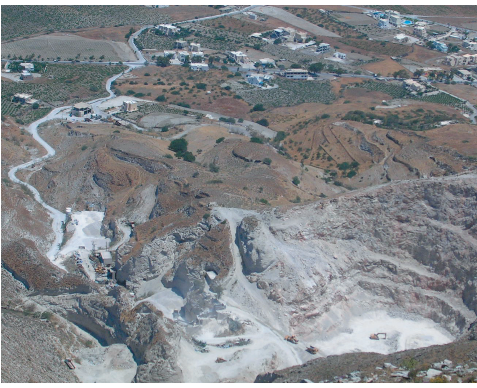
Quarry in Profitis Ilias with potential for reclamation

Off-season transportation. At present, the frequency of transportation connections between Santorini and its connecting points is drastically reduced between the end of October and the beginning of May. During these months there are fewer flights and ferries, and those are often at inconvenient times. Reduction in travel options and timing is not conducive for winter tourism and the economy beyond tourism. Therefore we recommend that the local trade associations, in collaboration with the two municipalities and the Perifereia, forge an agreement with the two domestic airlines under which, the Santorini tourism industry will accept the responsibility to undertake structural changes to encourage year-round tourism while the airlines accept the responsibility to provide regular and