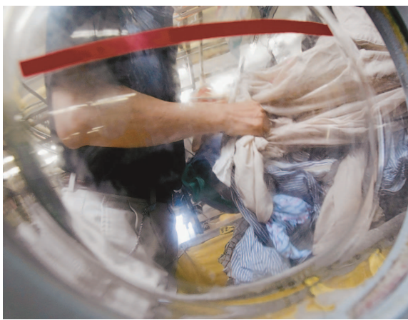
Pacific Heights Cleaners uses environmentally friendly detergents in its dry cleaners.

Your dry cleaner may claim to be "green" or "environmentally friendly," but San Francisco officials warn that the business is probably using a hazardous chemical solvent that could be harming you, your cleaner and the environment. The city's Department of the Environment spent months assessing the risks of dry cleaners. Now, the agency that initiated the plastic bag ban and mandatory composting has a new goal: eliminating chemical cleaning. The department is embarking on an educational and legislative campaign to get the city's 360 dry cleaners away from Dry cleaners continues on A12