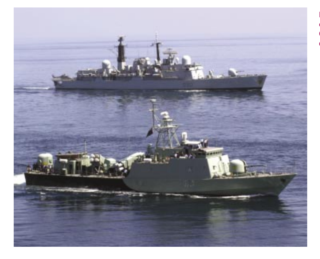
HMS Southampton exercising with an Omani patrol vessel during Saif Sareea II