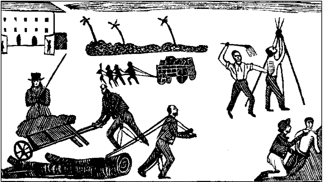
Convicts at Brisbane.

“The Steelbacks” because floggings were such a common occurrence for its own members. His imposition of even more extreme punishment on convicts is not defensible, but is perhaps not surprising.