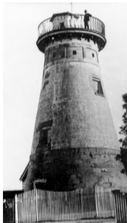
The Windmill on Wickham Terrace was built in 1828 during Logan's term as Commandant

Logan was a product of his times and had been shaped by his years of gruelling military experience. His regiment, the 57th, had been nicknamed