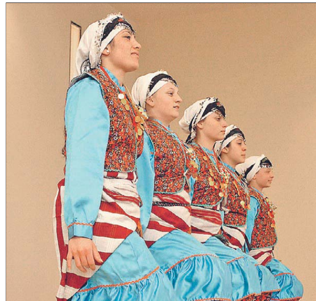
Celebration: Traditional Turkish Dancers entertain the crowd in the new Turkish Embassy.

Australian Foreign Minister Alexander Downer opened the building and said it reflected the close bond between the two countries that had developed since Gallipoli and that Turkish migrants were to be commended for their success in integrating into Australian society.