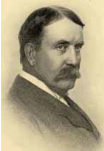
Daniel H. Burnham

and descriptions which were submitted in January 1906 and adopted by the Board in June 1906.