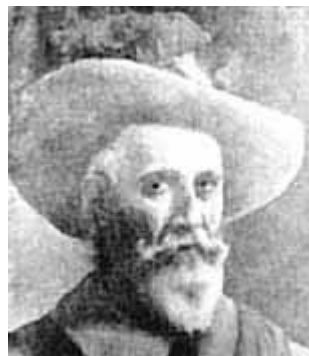
Miguel Lopez de Legazpi

In 1565, Spanish chroniclers found Muslim settlements in Manila which they referred to as a large prosperous community to the North in the island of Luzon. As soon as the news reached Miguel Lopez de Legazpi, he set out to conquer it. Two battles were fought over Maynilad, the second of which ending in a decisive victory for the Spaniards.