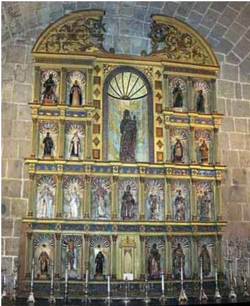
San Agustin Museum in Intramuros

It may not be apparent to the visitor, but Manila is actually one of East Asia's oldest cities. Predating even Tokyo, Manila traces its written history to 1571 when Spanish conquistadors, led by Miguel Lopez de Legazpi, wrested control of the city from its last pre-Hispanic ruler, Rajah Sulayman. In the ensuing centuries Manila grew into a thriving city, enriched by wealth generated by the worlds first global economy--the Manila-Acapulco Galleon Trade. The artistic treasures at San Agustin Museum offer an intimation of this fabulous wealth.