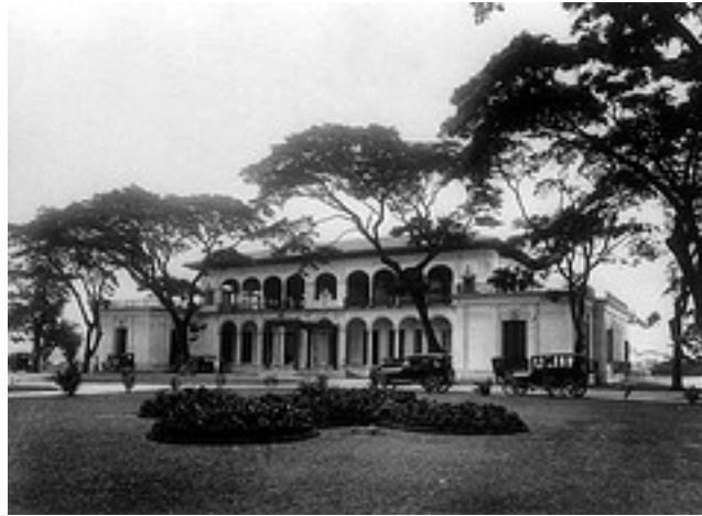
Malacañang Palace in 1926

Lakan Diyan which houses the Spanish governor-general), was then constructed and it became the seat of government and the nerve center of the country's cultural, social and economic life.