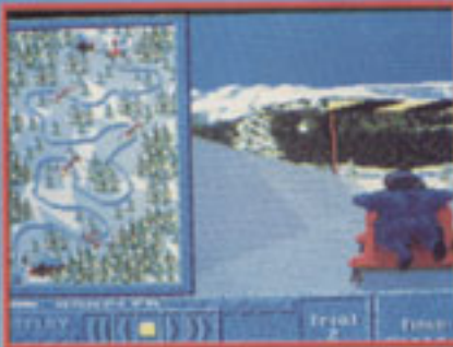
▲ The Bobsled event begins!

Every time you finish an event, The Games: Winter Challenge allows you to survey your performance step-by-step, by using the Instant Replay option. The VCR-like controls make it simple to study every aspect of your performance - including the bits where you completely cock it up!