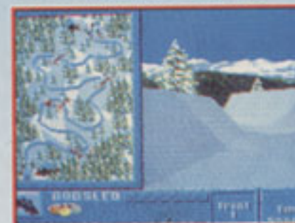
▲ The sharpest corner of all... ▼ And they've spooned it! What a wipe-out!