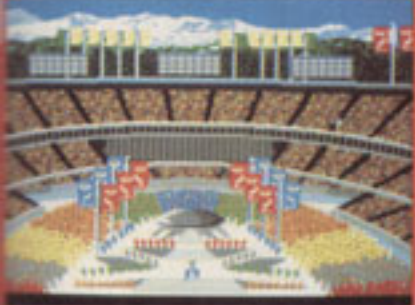
▲ The fab opening ceremony.