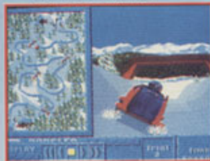
▲ Coming up to the bridge!