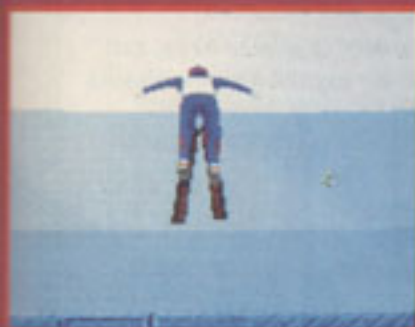
▲ Taking to the air in the Ski Jump!