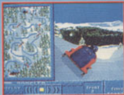
▲ The first difficult corner is handled with ease.