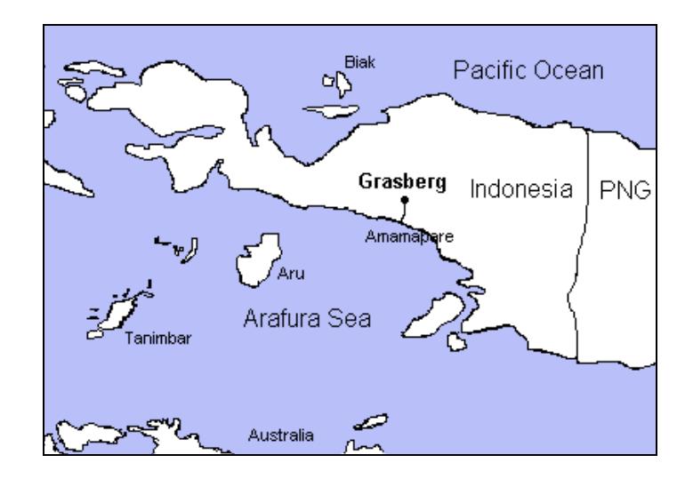
Figure J1. Location of the Grasberg Mine

The Grasberg mine is located in the central highlands area of the south side of Papua (formerly Irian Jaya), Indonesia (see Figure J1). It is the world's lowest-cost, largest producer of copper and gold.<sup>1</sup>