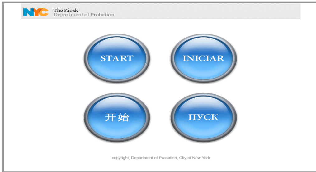
Figure 1. Reporting Kiosk Start Screen