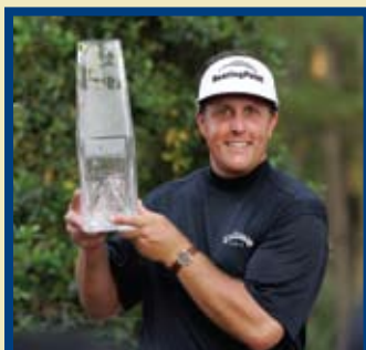
2007 PLAYERS Champion Phil Mickelson