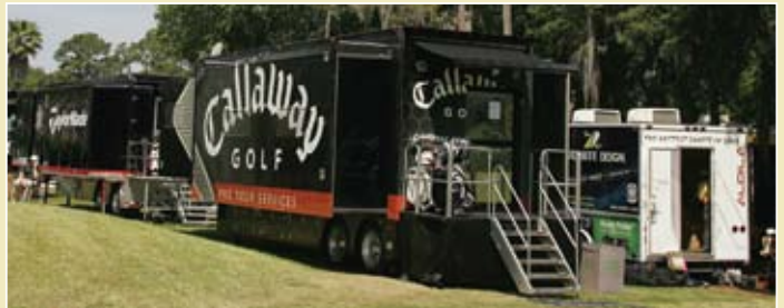
Club manufacturers have their trailers on site through Wednesday to help players with their equipment before the tournament begins.