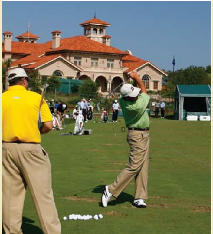
Fred Couples prepares for his 25th PLAYERS as others observe.

With each passing hour on the driving range, players come and players go. And as the sun climbs high into the Ponte Vedra Beach sky, the water bottles continue tumbling to the ground.