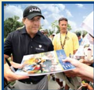
Mickelson signs autographs earlier this week.

"I think the changes make a big difference for me because in the past the short game was not as integral an element in this tournament," Mickelson said. "The (high) rough around the greens (prior to 2007) was so difficult that it was the same for everybody. Now there are so many mown-out areas where you can chip, you can putt, you can lob it. It's a