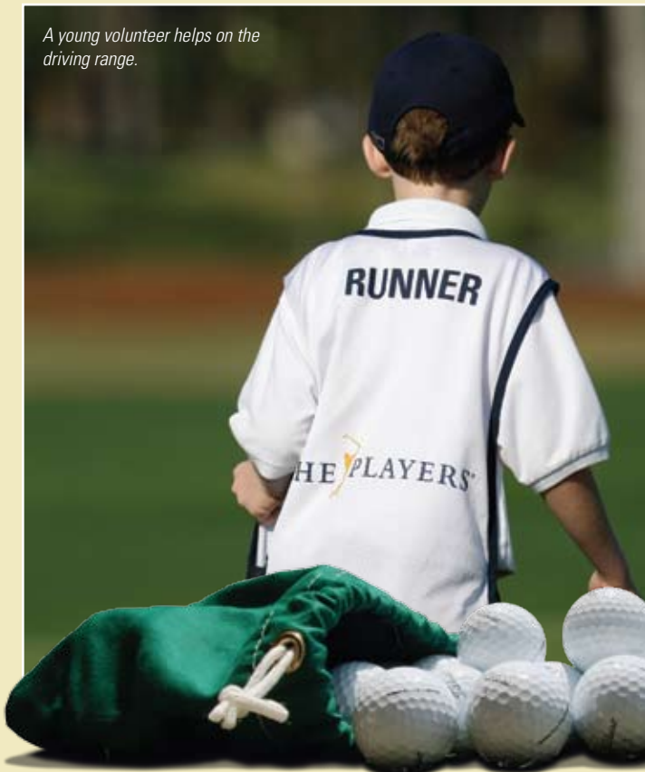
A young volunteer helps on the driving range.