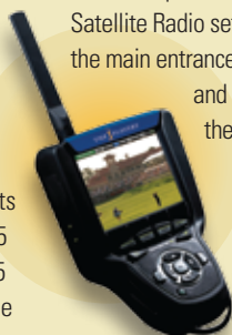
Stadium TV set

Complimentary all-day trials of Satellite Radio sets will be available at the main entrance behind No. 17 (P2) and near the entrance to the Stadium Village.