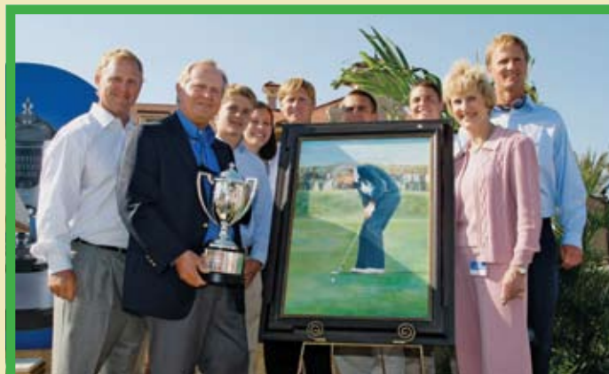
JACK HONORED Jack Nicklaus, flanked by his family, accepts the PGA TOUR Lifetime Achievement Award on Wednesday at TPC Sawgrass.

Guests to THE PLAYERS can also get a taste of the World Golf Hall of Fame in the tournament's Welcome Pavilion, located near the tournament entrance. The pavilion illustrates the