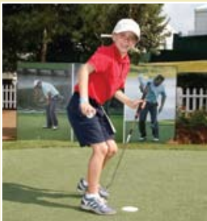
A young fan enjoys putting on the 18th green in the Stadium Village.

THE PLAYERS Stadium Village, an area where fans gather for an interactive experience, debuted in 2007 and will move to a more central location adjacent to the clubhouse in 2008, with a focus on the 16th, 17th and 18th holes. Fans can still attempt to hit the 17th green on a one-quarter-scale 17th hole at the UBS 17th Hole Challenge. In addition, fans can relive famous shots on the par-5 16th hole at a swing simulator and try some of THE PLAYERS' famous final putts on a replica of the 18th green. Finally, fans can have their photos taken with THE PLAYERS trophy that goes to the winner.