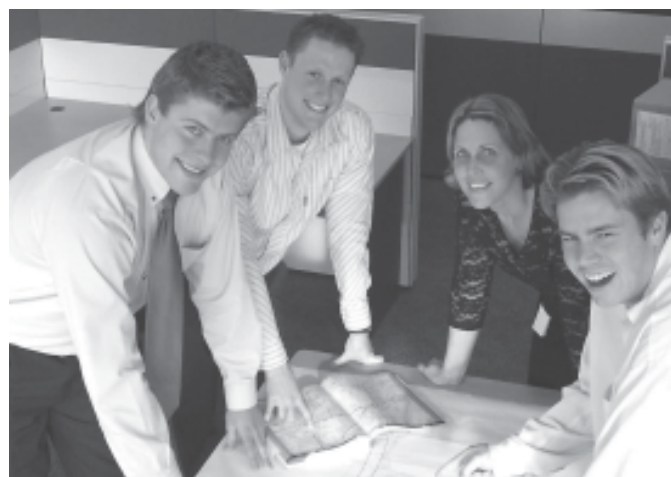
Geelong Bypass staff, happy to help with your enquiries.