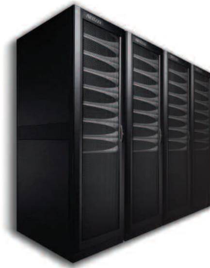
Figure 2 Capable of scaling to hundreds of terabytes of data, the Netezza Performance Server system also scales in processing performance to power critical BI applications. Shown is the four-rack NPS 10400 system.