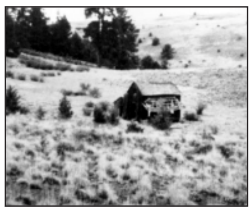
Drought, erosion and insects forced many homesteaders to abandon their homes.

The Crooked River National Grassland works with the Confederated Tribes of Warm Springs to maintain traditional plants and foods, preserve traditional cultural practices and protect archaeological and spiritual sites.