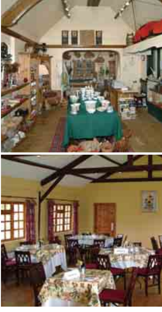
clockwise from top: the Shop, Chestnut Lodge Restaurant, the Courtyard Tea Room and Chapel.

The entrance fees allow your members to stroll around the front lawns and extensive grounds. A recently planted avenue of horse chestnuts leads down to the lake, and the famed Jersey cows can sometimes be seen grazing in the fields beyond. The Loseley Gift Shop sells a fine range of the unusual as well as the more traditional items, and this is also where you can buy a tub of Loseley ice cream. If you would like to visit the little Chapel, a haven of peace for quiet reflection, please let us know and we will arrange for it to be open.