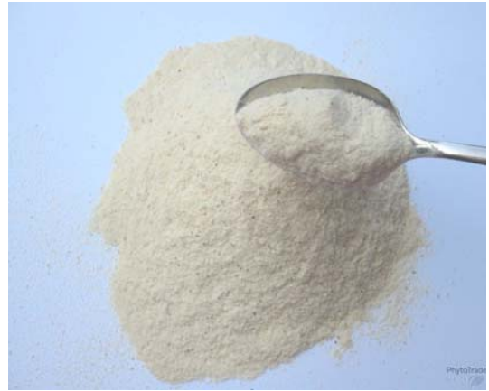
Powdered dried fruit pulp