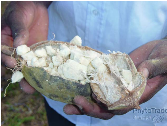
Open fruit with the dried fruit pulp

Baobab seeds may be eaten raw or roasted. They have a pleasant nutty flavour and are a good coffee substitute, when roasted and ground. The seeds have a very high oil content, tough husk and soft kernel, devoid of starch.