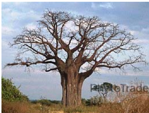
Exemplar of Adansonia digitata L. in the dry season