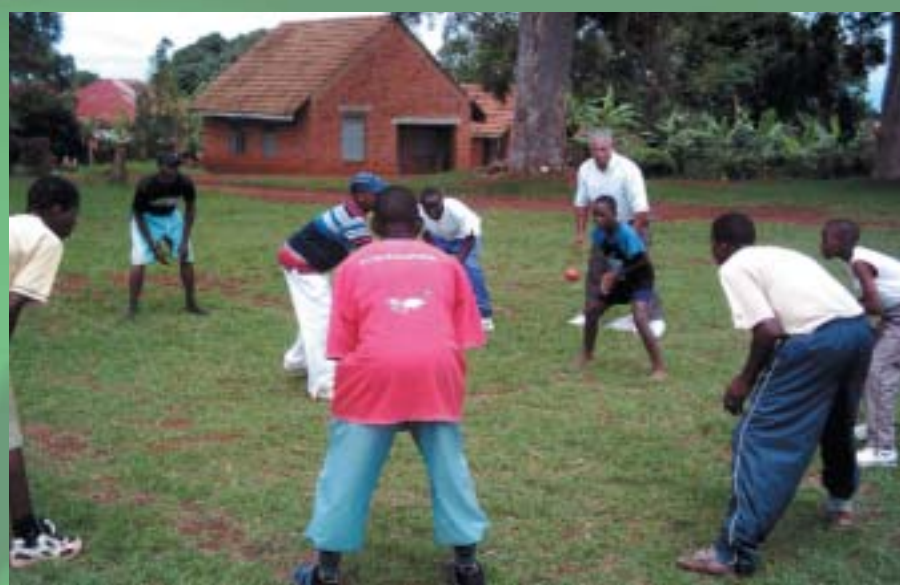
On the up: Cricket is enjoying a surge in popularity in Uganda with more than 25,000 involved in the game and these three scenes reflect that. Clockwise from left, a landmark reached at the ICC Trophy; coaching from South Africa fast bowler Makhaya Ntini; and grassroots fun and games.