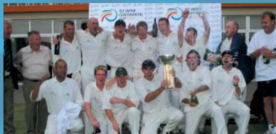
Winners are grinner: It's celebration time for three winning sides in ICC tournaments in 2005. Scotland (top) celebrate success in the ICC Trophy in Ireland last July; Papua New Guinea (bottom left) are all smiles after winning the ICC World Cup Qualifying Series Division Two event in Malaysia in February; and Ireland are victorious in the ICC Intercontinental Cup in Namibia in October.