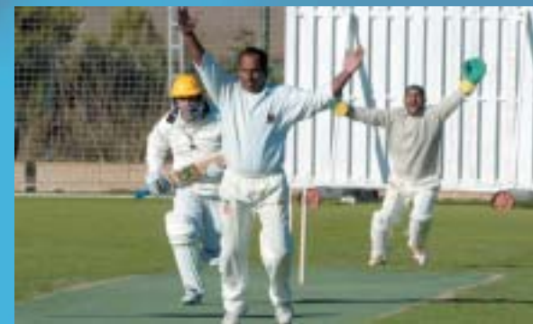
Catching on: Cricket in Europe is about so much more than just England. These players from throughout the region demonstrate exactly that during coaching sessions and match play.