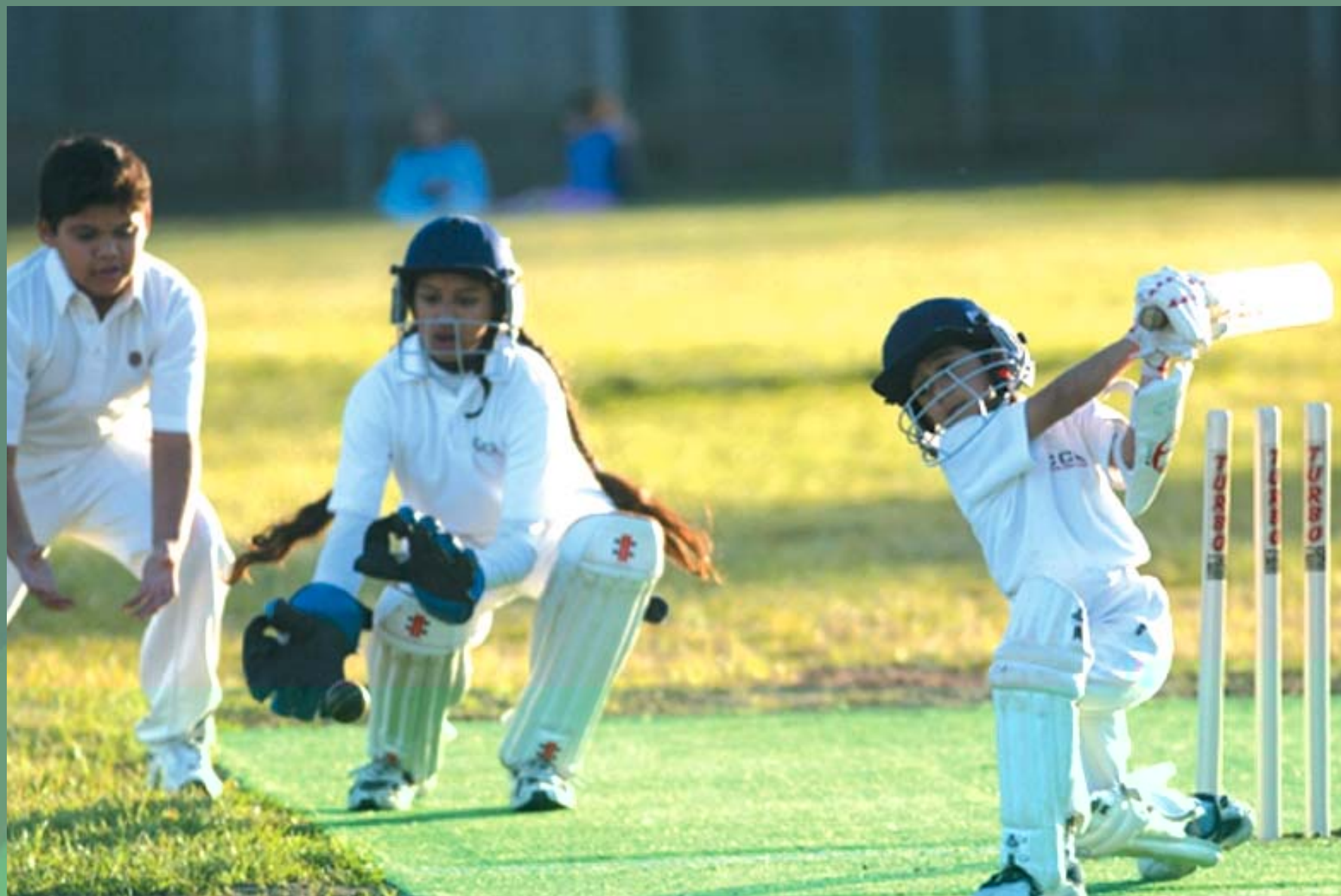
This is cricket: Taken in Northern California and the first winner of the ICC Development Program Annual Awards Photograph of the Year, this picture sums up everything good about the game: concentration, intensity, enjoyment and a sport that is played and loved by both boys and girls.