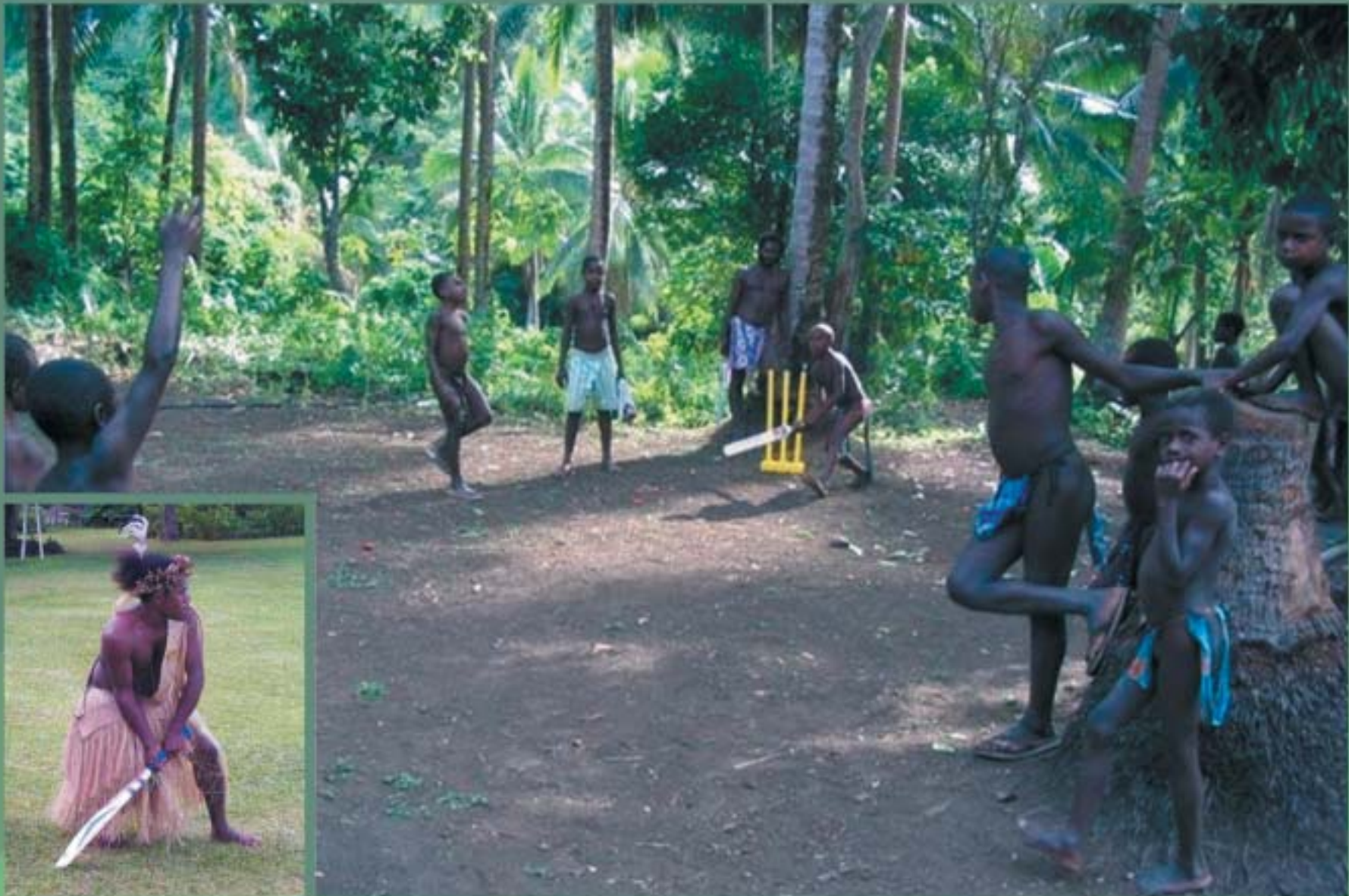
Cricket East Asia-Pacific style: Two photos from Vanuatu that reflect a love of the game on the island among young and old alike. More than 5000 children are involved in organised cricket programs.