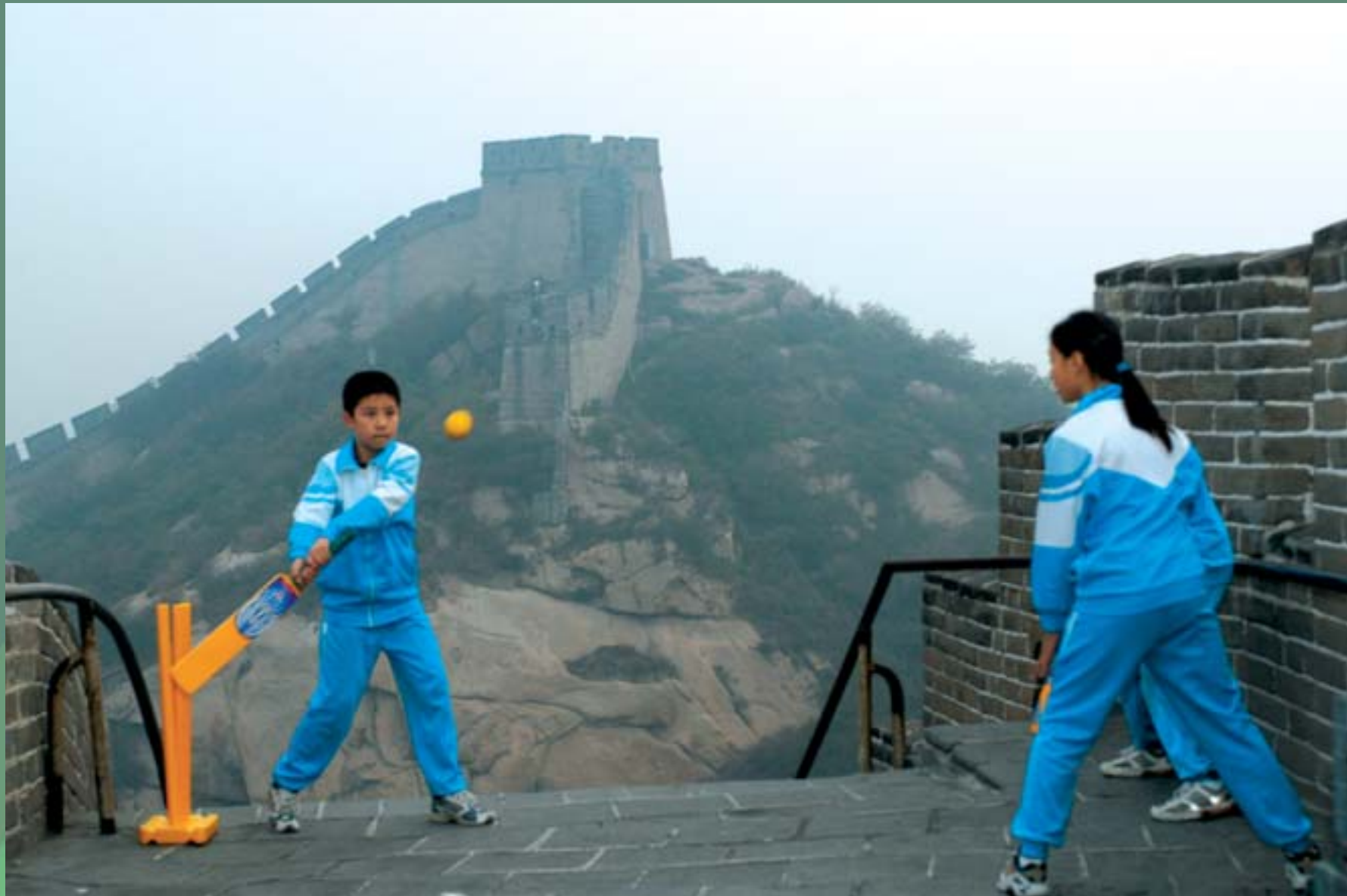
Cricket without boundaries – but with walls: youngsters demonstrate their love for the game on The Great Wall of China. The Chinese Cricket Association has been an ICC Affiliate member since 2004.