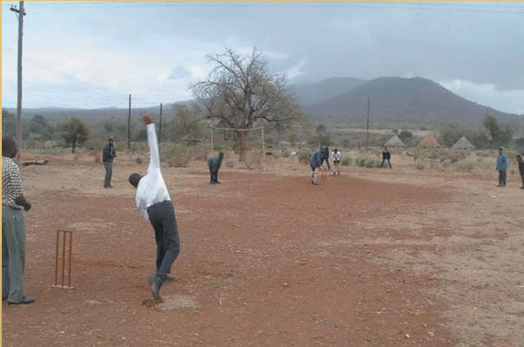
Test Match Special: A passion for playing the game will always overcome a lack of facilities, as this photograph from Africa demonstrates. It may be a long way from the manicured green grass of Lord's or Newlands but, for these players, it is the centre of their cricketing universe.