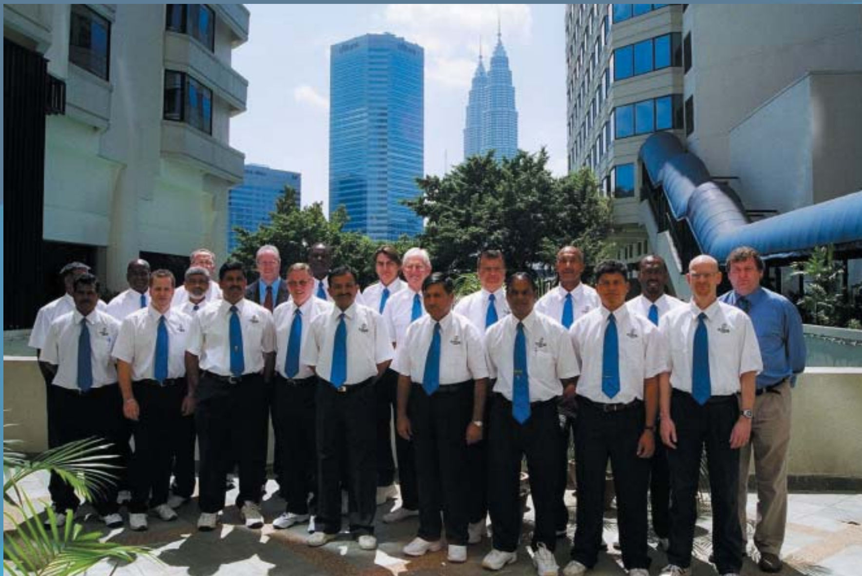
Decision time: Umpires from the ICC's Associate and Affiliate members met in Malaysia in February 2005 ahead of the formation of the first-ever Associate and Affiliate Panel which gives officials from the 86 countries full member status a pathway to umpiring at the highest level.