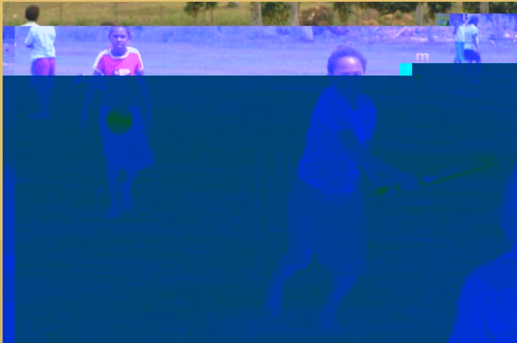
Four! A girl from the East Asia-Pacific region hammers a ball away during a game of junior cricket. In 2005 women's cricket came under the banner of the ICC, a move that should ensure the game continues to grow.