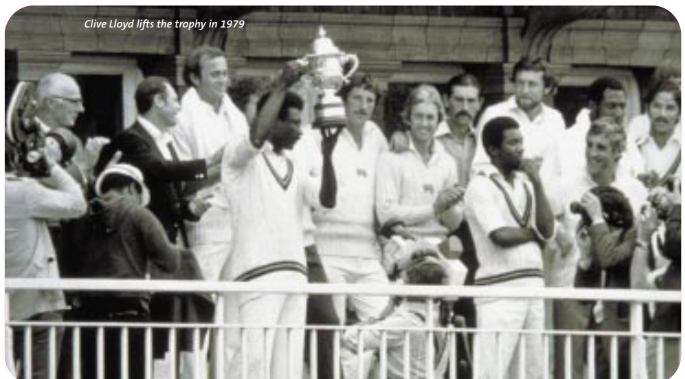
Clive Lloyd lifts the trophy in 1979

I try to get to the ground at about 8am to check that everything is in place. Security is increasingly important so those arrangements need to be checked as well. Once the match begins I watch every ball from a suitable vantage point. We have to mark the umpires, enforce the Code of Conduct and make sure the captains and umpires complete all of their paperwork. It is a long day but it remains a pleasure to be involved in the game I love.