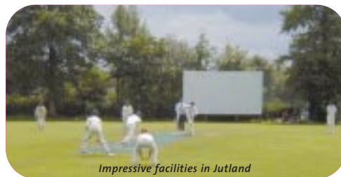
Impressive facilities in Jutland

Teams: Denmark, Holland, Ireland, Scotland