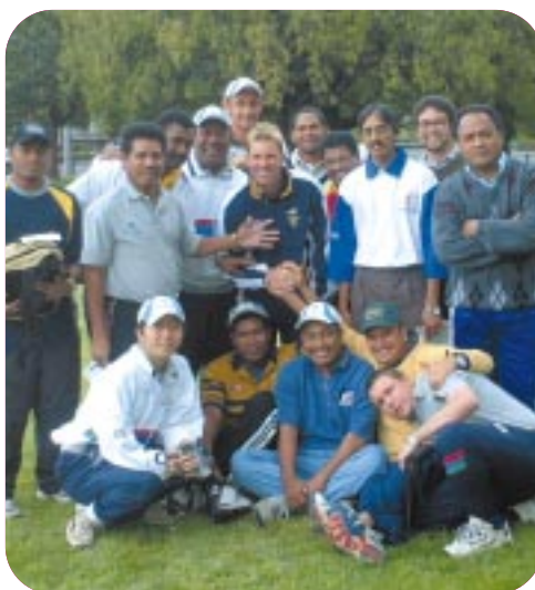
Seminar attendees meet Australian leg-spinner Shane Warne

Cricket is very much alive and positive in Afghanistan where the sport, brought in from neighbouring Pakistan, is now becoming a passion among young Afghans.