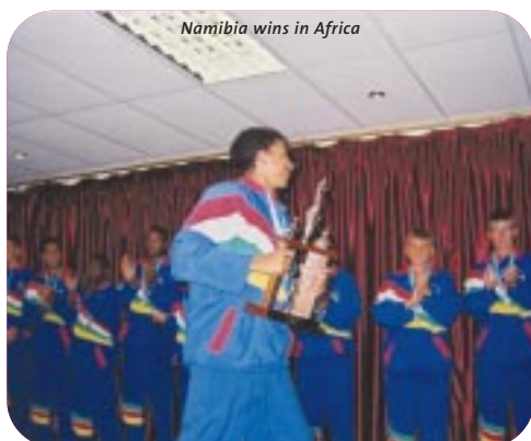
Namibia wins in Africa

Teams: Botswana, Lesotho, Malawi, Namibia, Zambia