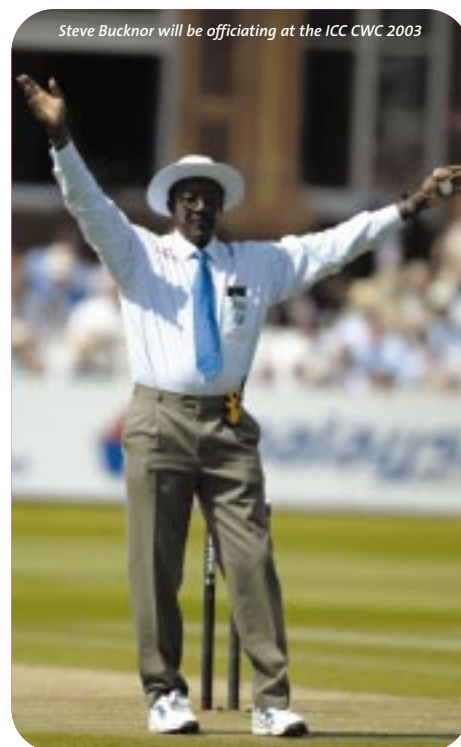
Steve Bucknor will be officiating at the ICC CWC 2003

If a player is, in the opinion of his team manager, unfit to play a useful part in any match during the remainder of the event a representation can be made to the Event Technical Committee. A panel