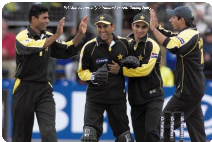
Pakistan has recently introduced an Anti-Doping Policy