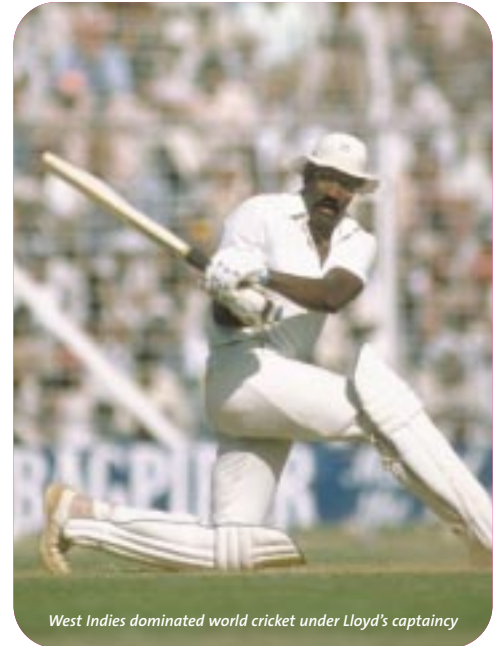
West Indies dominated world cricket under Lloyd's captaincy

The match referee is basically responsible for making sure that everything runs smoothly, to make sure that the players, the pitch, dressing rooms, scorers and technology are all in order. Everything is analysed on television today so it is important that players respect and observe the Code of Conduct because you've got to make sure that youngsters see the game played in the right spirit.