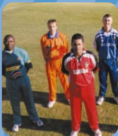
The four captains at the Six Nations tournament in Namibia, April 2002

As well as the 10 Full Members of the ICC, four other countries will be competing at the ICC Cricket World Cup 2003 in southern Africa. Representatives from Canada, Holland, Kenya and Namibian shed light on their cricketing pedigree.