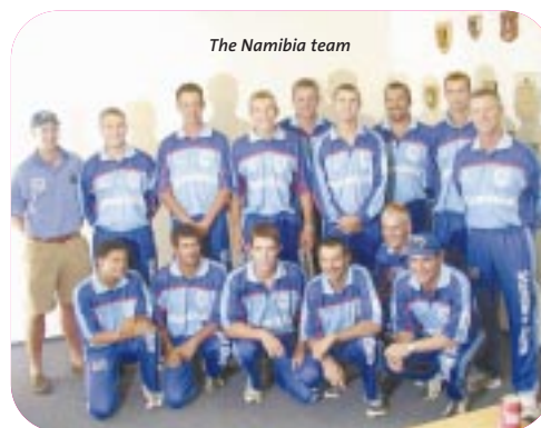
The Namibia team

win ten matches on the trot, reaching the final and qualifying for the ICC Cricket World Cup 2003.