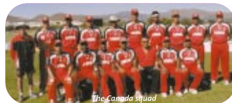
The Canada Squad

The Canada team is comprised of primarily part-time amateur players with non-cricket employment. In the build up to the ICC Cricket World Cup, indoor evening net practices have been the main source of preparation.