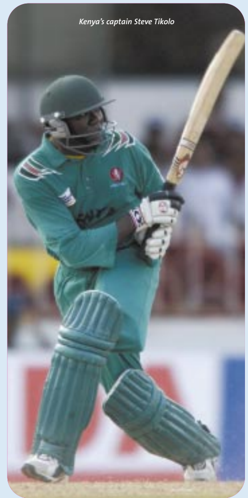
Kenya's captain Steve Tikolo

Steve Tikolo has a reputation as a dashing stroke player and his contribution with the bat will be crucial to Kenya's chances.