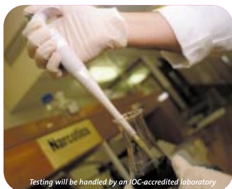
Testing will be handled by an IOC-accredited laboratory

"But we've got to ensure the game's name does not get smeared by any violations."