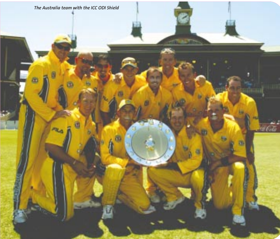
The Australia team with the ICC ODI Shield

Australia became the first holders of the ICC One Day International Championship Shield at the Sydney Cricket Ground on Friday December 13th 2002.