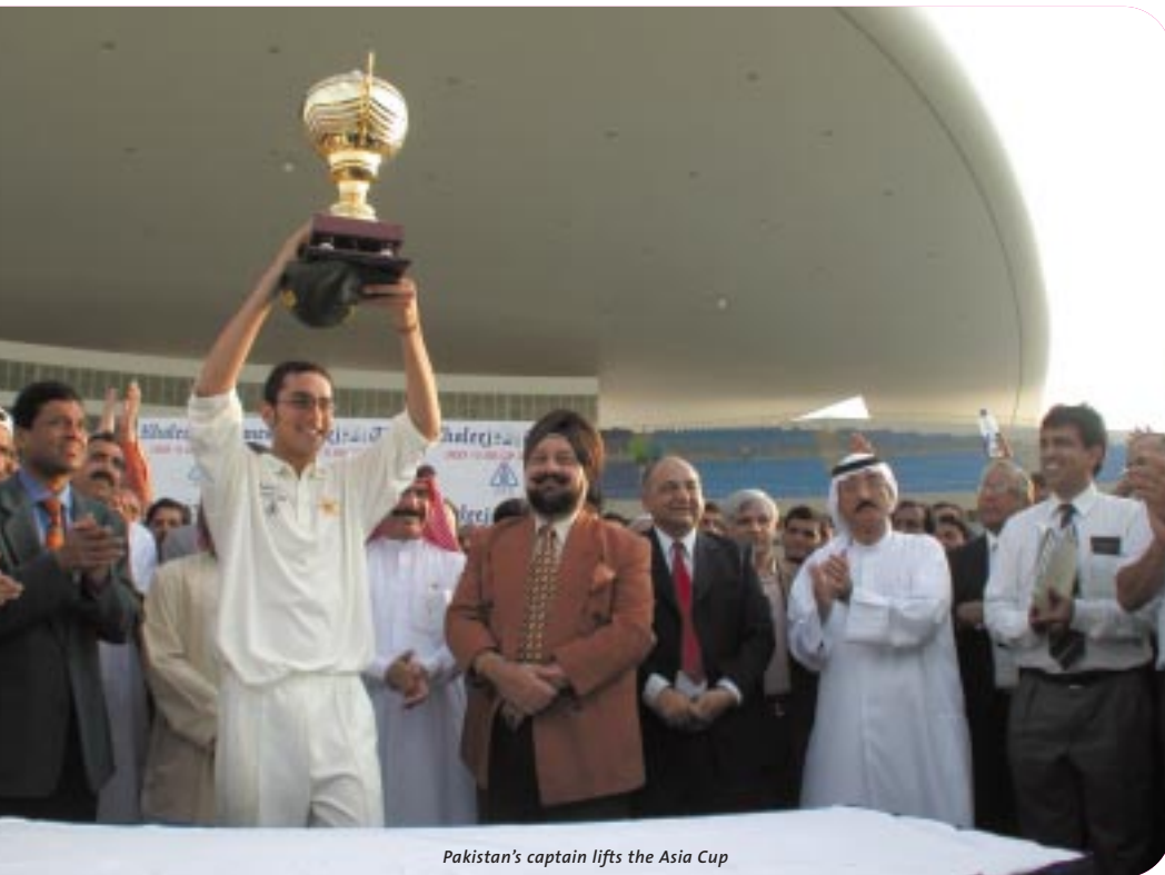
Pakistan's captain lifts the Asia Cup

The next generation of international cricketers stepped into the limelight in four successful regional U-15 tournaments in 2002.