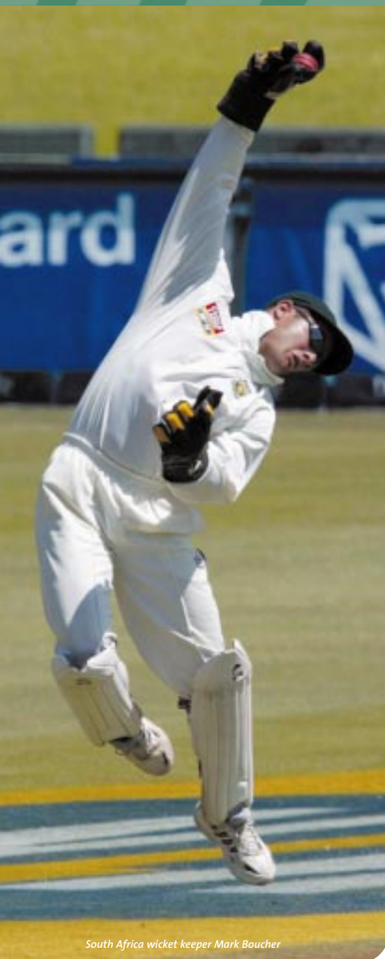
South Africa wicket keeper Mark Boucher

South Africa became the first side to displace Australia at the top of the ICC Test Championship table by winning the home two-Test series against Pakistan in January 2003.