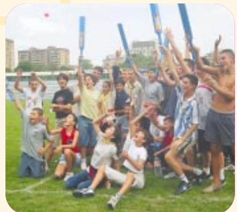
Spirit of Cricket in Kosovo

Highlights of the improved site will include regular updates on SOC activities from around the world in addition to a cricket resources section, which will cover issues such as the Laws of Cricket and the Code of Conduct. To find out more on SOC and other ICC development initiatives visit www.icc.cricket.org .