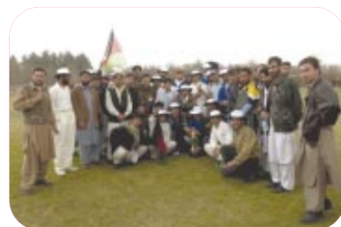
Afghanistan cricket team

Cricket is very much alive and positive in Afghanistan where the sport, brought in from neighbouring Pakistan, is a growing passion among young Afghans. A provincial tournament featuring 27 teams was recently held in the capital city of Kabul. The enterprising cricketers used a pitch made from a combination of straw and mud that was watered, swept and rolled over many days.