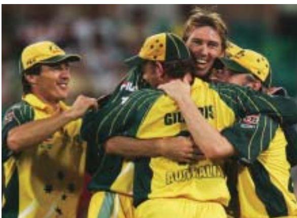
Australia's Glenn McGrath leads the LG ICC Test and ODI bowling rankings.