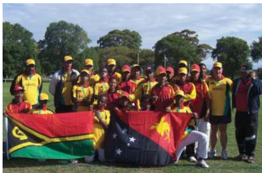
PNG won the first ever EAP junior tournament.