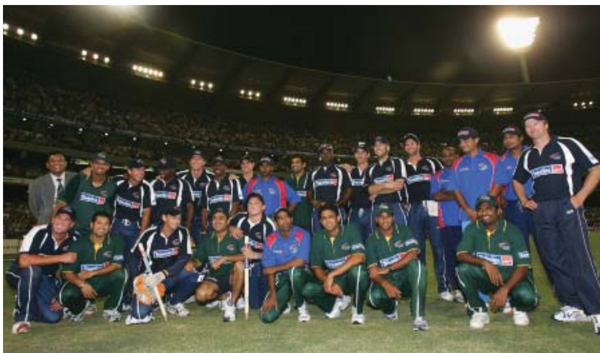
Players from both teams gather together after the match at the Melbourne Cricket Ground.

Only two weeks after the tragedy of the Asian tsunami, many of the world's best cricketers and over 70,000 fans joined forces at the Melbourne Cricket Ground to produce an unprecedented cricketing occasion.