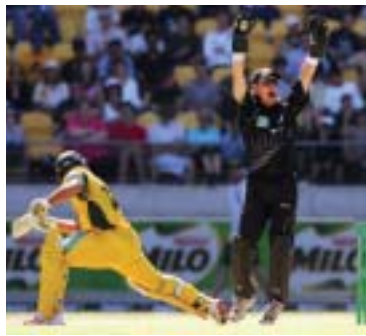
◀ The fourth ODI between New Zealand and Australia will be the first match under the new protocols.

'The reality is that this new process provides the game with a sensible