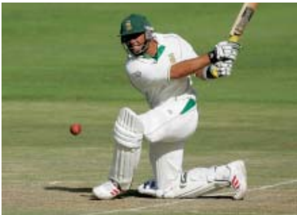
South Africa's Jacques Kallis topped the LG ICC Test batting rankings.