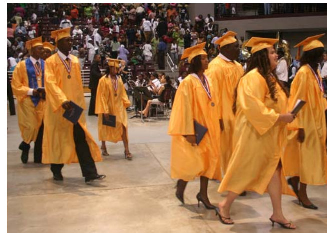
Forest Brook High School Graduation