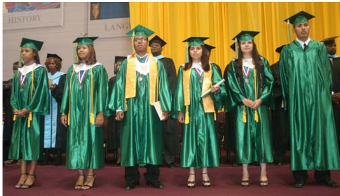
Smiley High School Graduation