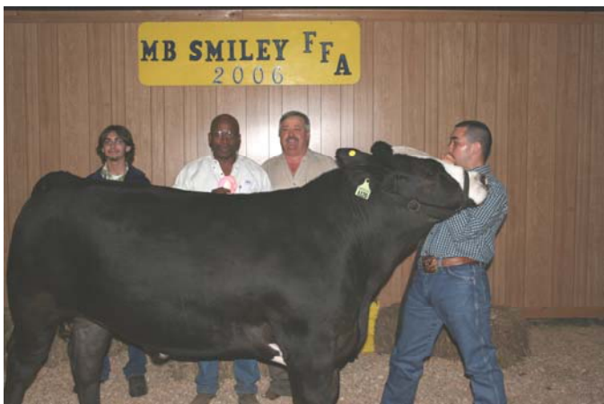
BFI representatives with NFISD students at Smiley FFA Auction