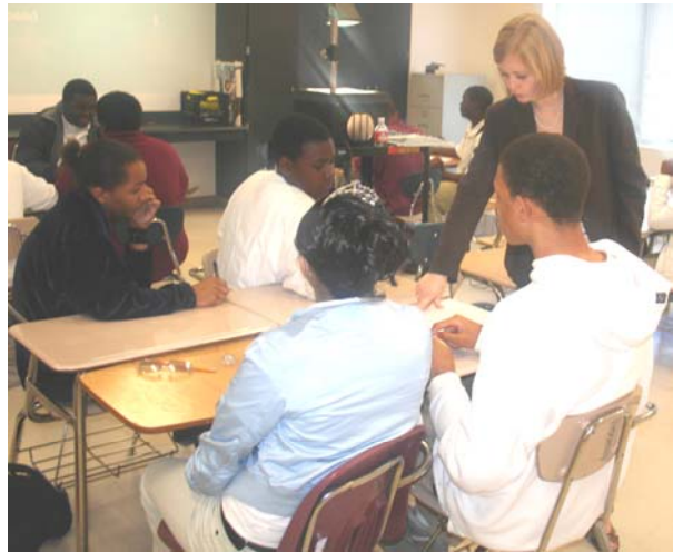
CenterPoint Energy representative working with students on project.