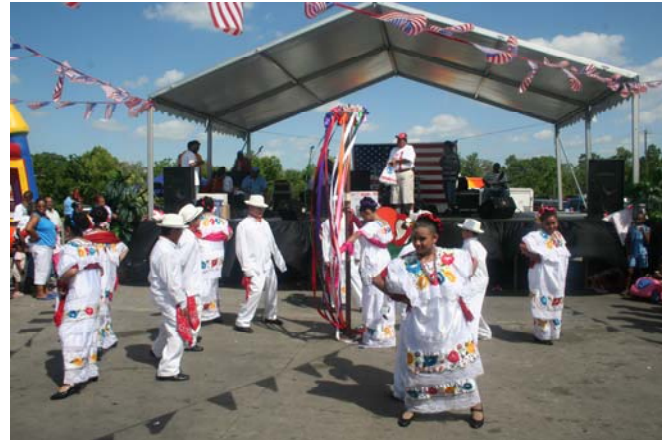
NFISD End-of-Year Celebration