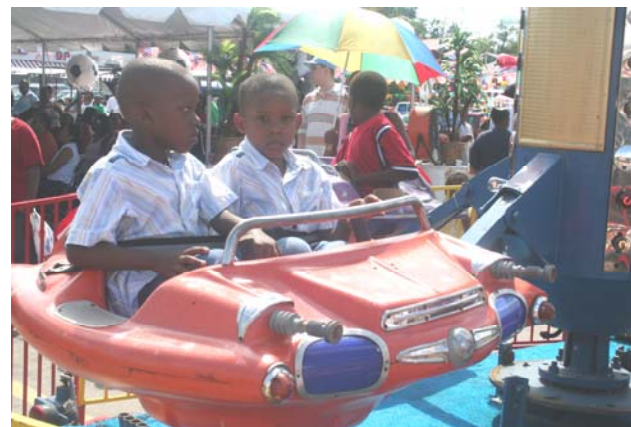
NFISD End-of-Year Celebration