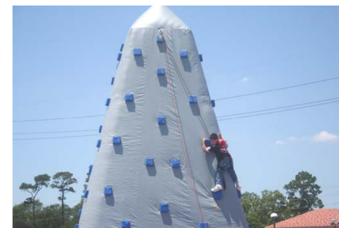
NFISD End-of-Year Celebration