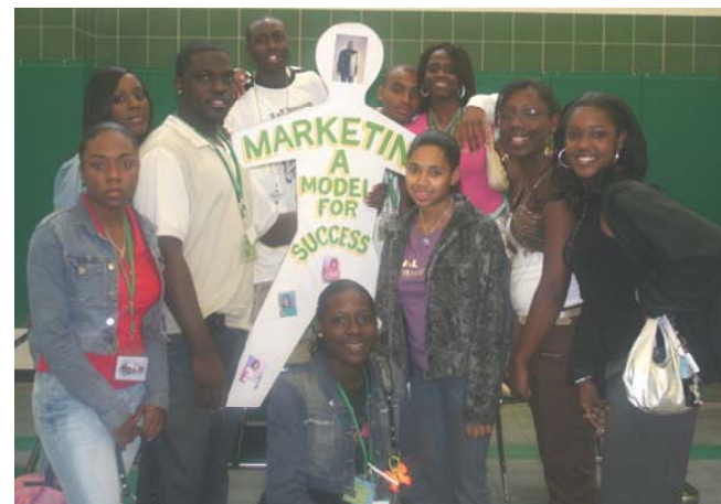
Smiley High School students at Hilliard Elementary Career Day