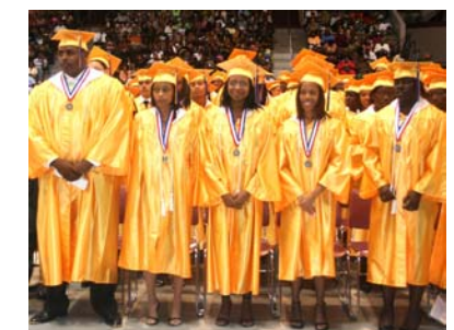
2006 Texas Scholars graduates from Forest Brook High School.

Certified counselors serve North Forest ISD students at every grade level. They provide both individual and group counseling and a myriad of other services. Dual Credit courses are offered at both M.B. Smiley High School and Forest Brook High School. The courses offered are college credit courses that lead to a certificate or a degree and are transferable. Additional information about the district counseling program can be obtained from the director of guidance and counseling, 713-491-1008 or individual campuses.