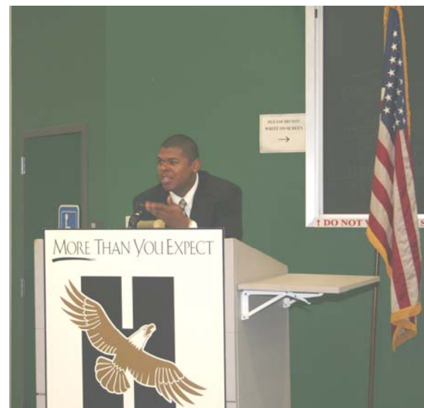
NFISD student at Dual Credit Celebration at Houston Community College