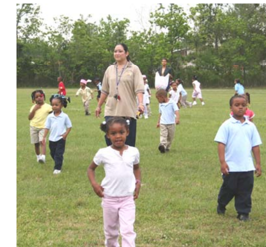
Thurgood Marshall Egg Hunt