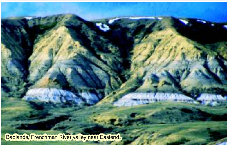
Badlands, Frenchman River valley near Eastend.

The Drumheller and Dinosaur Provincial Park areas in southern Alberta may be Canada's best known badlands, but southern Saskatchewan can lay claim to its own, in the Big Muddy, Frenchman River valley, Grasslands National Park, and Avonlea regions.